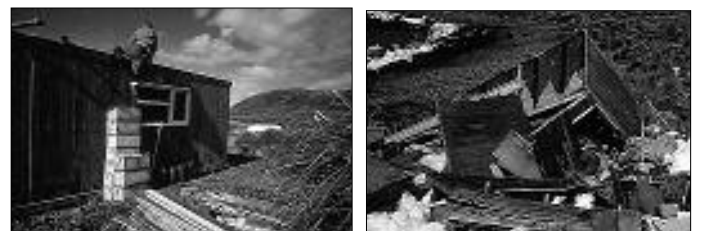
Arnov House: before and after the wave.