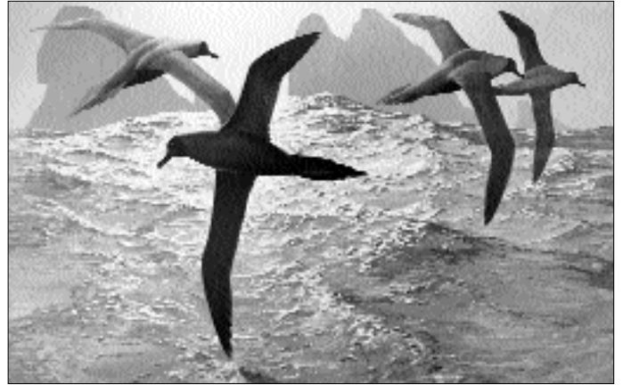
Around the Shag Rocks, light-mantled sooty albatrosses, by Keith Shackleton. (107 cm x 72 cm, landscape)

The RSPB is selling Limited Edition Keith Shackleton prints in aid of the Save the Albatross Campaign for £350 which feature Light Mantled Sooty Albatross at Shag Rocks. Go to www.rspb.org.uk/international/albatross_appeal/dinner/index.asp?view=