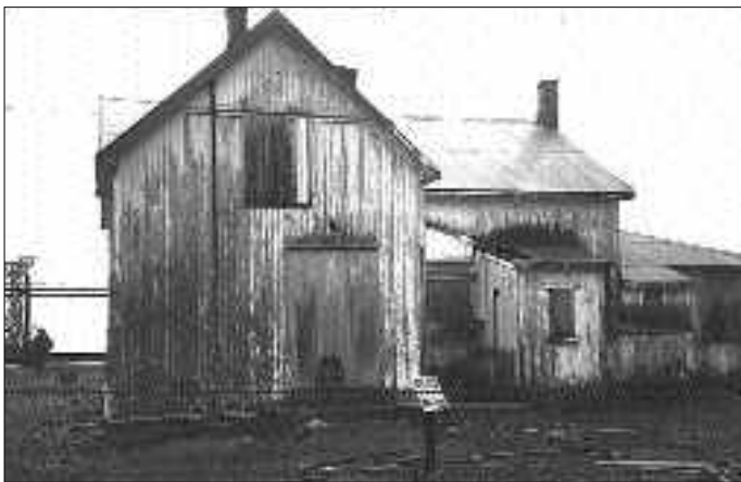
The Stromness Villa with its memorial plaque.