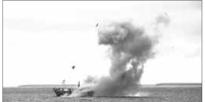
The option eventually chosen for the Elqui.

Illegal, Unlicensed and Unreported Fishing operations and a considerable portion of our budget is spent on patrolling and surveillance. We are therefore pleased to report to you the arrest and conviction earlier this year of a notorious poaching vessel the Elqui . She and her catch were confiscated in Stanley and we are now considering options for her future to ensure that she never fishes again.