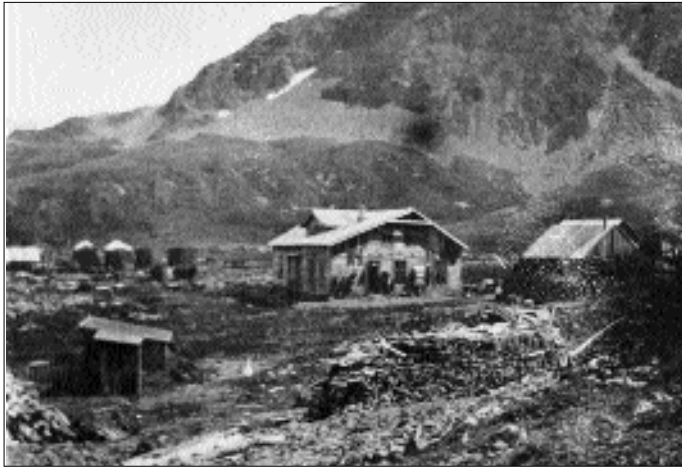
'Capt. Larsen's dwelling'. The first Villa at Grytneken photographed during the visit of HMS Sappho in 1906. The photograph is one of the historic items displayed during the visit to the Hydrographic Office.

The archives of the UKHO are a treasure chest of charts, atlases and printed books, letters, reports, remark books, notices to mariners, tide tables and much else besides. Philip Clayton-Gore showed us round the new reading room and produced several early charts of South Georgia and the Antarctic, including – most evocative of all – Frank Worsley's plotting sheet of the course of Shackleton's Endurance .