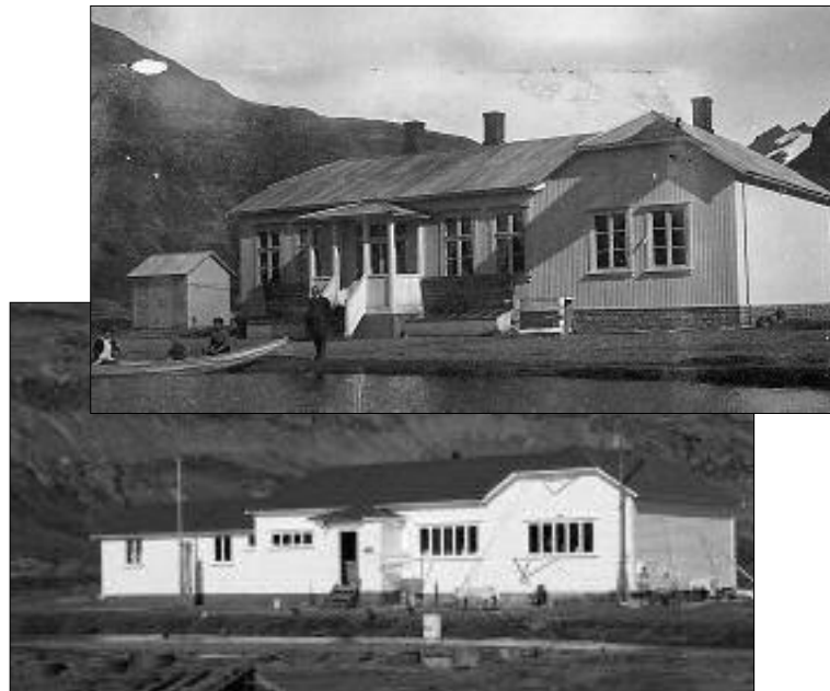
Husvik Villa: In the early days and after restoration..

Like other buildings in the whaling stations (including the Grytviken Villa), the Husvik Villa has been becoming dilapidated. Through the South Georgia Heritage Trust, this has now been remedied thanks to the generosity of the Norwegian county of Vestfold, where the Norwegian whaling industry was centred, the municipality of Sandefjord and local companies.