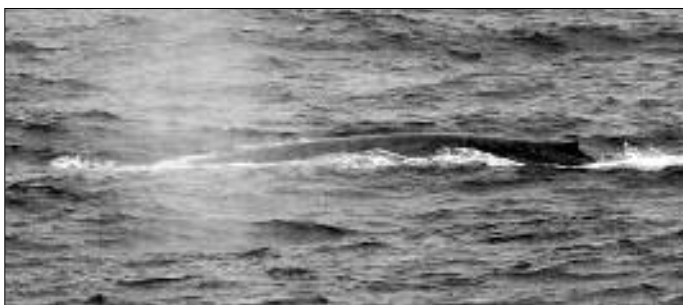
The long, long back and tiny fin of a blue whale.

This amazing spectacle gave Ian the chance to compare the whales' blows. The stiff breeze meant that conditions were not ideal but he got the impression that fin whale blows