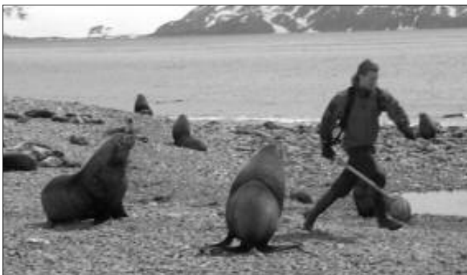
Finn McCann avoids fur seal bulls.