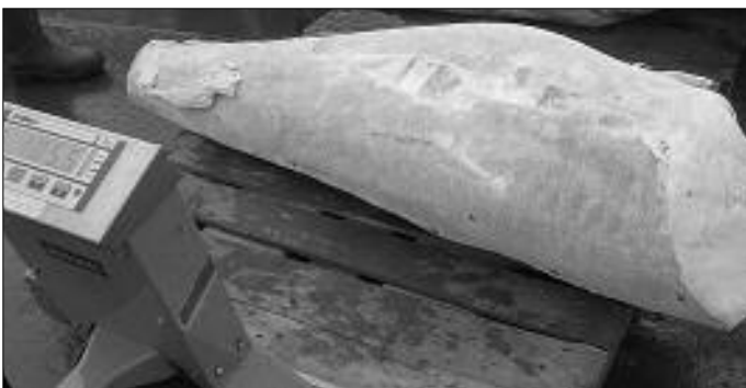
A toothfish 'trunk' - topped, tailed and gutted. It weighs 105.5kg and is worth up to £1,100 at the quayside.