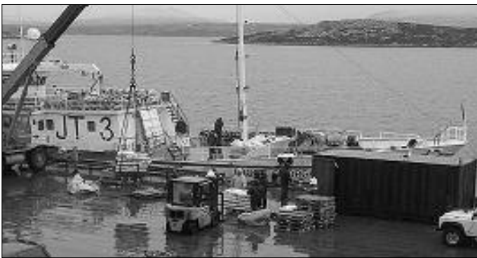
Unloading toothfish from the Argos Georgia at Stanley.

Incidentally, during last season's fishing by eight vessels, not a single flying seabird was caught in the South Georgia longline fishery. The only casualty was a gentoo penguin which was snagged and drowned. The Government of South Georgia and its officers are to be congratulated on their success at regulating the fishing industry. If only the simple but effective techniques of keeping albatrosses away from the baited hooks could be applied worldwide! Until they are, South Georgia's albatrosses will not be safe.