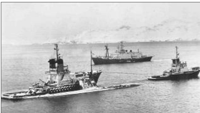
Santa Fé on her way to a temporary resting place off Hesteshletten.. The submarine leans against Salvageman, which is towed by Yorkshirer. Endurance is behind them.

Endurance returned quickly and covertly to South Georgia knowing that she was a primary target, that no support was yet available in those waters, that her observation and signals abilities were critical, and that the Argentines were about to