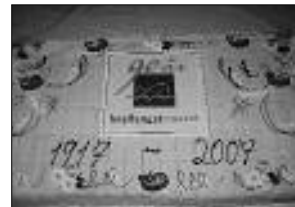
The museum's birthday cake.

The reception at the museum was a well-attended friendly event, complete with birthday cake, speeches and singing, followed by the opening of two new exhibits. I was impressed by the regard and respect shown by everyone for their controversial whaling past. The museum is really well presented and leads you comprehensively through the history of whaling (and has labels in English!). And it was good to meet some of our Øyas Venner friends who have often been over for SGA events.