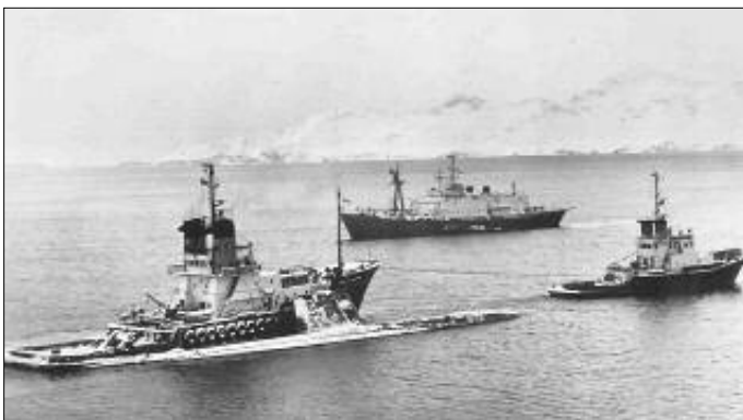
Santa Fé on her way to a temporary resting place off Hestestletten.. The submarine leans against Salvageman, which is towed by Yorkshirian. Endurance is behind them.

Endurance returned quickly and covertly to South Georgia knowing that she was a primary target, that no support was yet available in those waters, that her observation and signals abilities were critical, and that the Argentines were about to