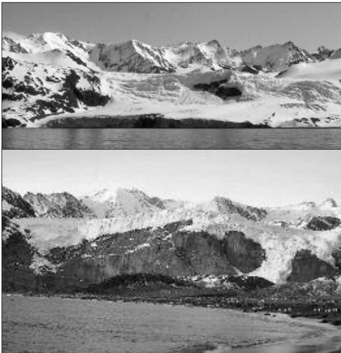
The Bertrab Glacier at Gold Harbour was photographed by Frank Hurley in 1914 when it terminated in an ice cliff resting on a beach at high water mark. The upper photo, taken in 1964/5 by Bill Vaughan sealing inspector at Grytviken, shows little appreciable change in the intervening period. Since the 1980s, however, most of the lower section of the glacier has disappeared entirely, exposing the large rock cliff in the lower photo taken in 2006/7 by Bob Burton. The glacier has retreated over 0.8km and is now separated from the sea by an open bay behind the moraines.

As part of the Royal Scottish Geographical Society's Scotia Centenary Expedition to South Georgia in 2003, we conducted a study of glacier changes over the last 100 years or so, using a variety of documentary and geomorphological records, including historical photographs. We have looked at a sample of 36 glaciers in different parts of the island. Of these glaciers, two are currently advancing, 28 are retreating and six are stable or show a complex response. Most glaciers on the north-east coast of the island attained more advanced positions during the late-19th century. Since then, smaller mountain and valley glaciers have progressively receded. Larger glaciers that have higher accumulation areas in the Salvesen and Allardyce Ranges generally remained in relatively advanced positions until the 1980s.