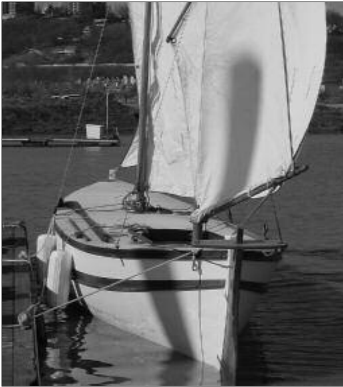
The replica of James Caird that will be on display at Grytviken.