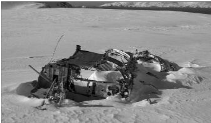
The wreck of an Argentine helicopter is one of the few relics of the conflict.

remark that, all things considered, it was good that nobody present knew anything of the history of torture and murder that Astiz had accumulated.