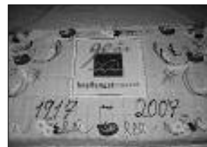
The museum's birthday cake.

The reception at the museum was a well-attended friendly event, complete with birthday cake, speeches and singing, followed by the opening of two new exhibits. I was impressed by the regard and respect shown by everyone for their controversial whaling past. The museum is really well presented and leads you comprehensively through the history of whaling (and has labels in English!). And it was good to meet some of our Øyas Venner friends who have often been over for SGA events.