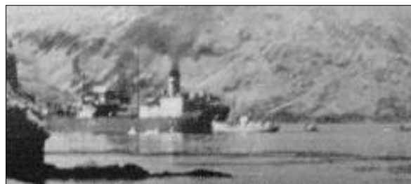
El Conquistador tows Lille Carl out of King Edward Cove in 1960. (From a cine film.)