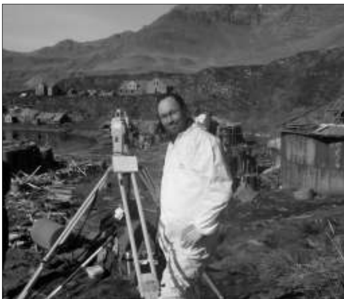
Prince Olav Harbour.