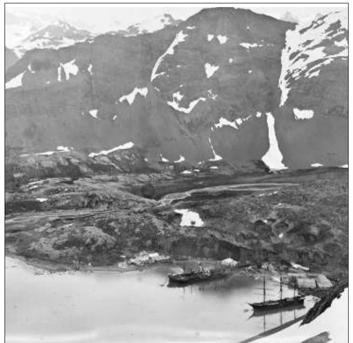
Leith Harbour, 1912.