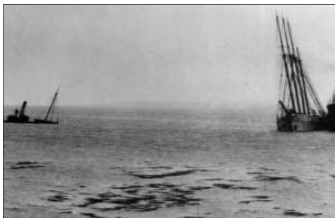
Busy bee lies burned-out to the left and badly-damaged Kathleen Annie is supported by another vessel to the right. Off Hatston slip, Kirkwall.