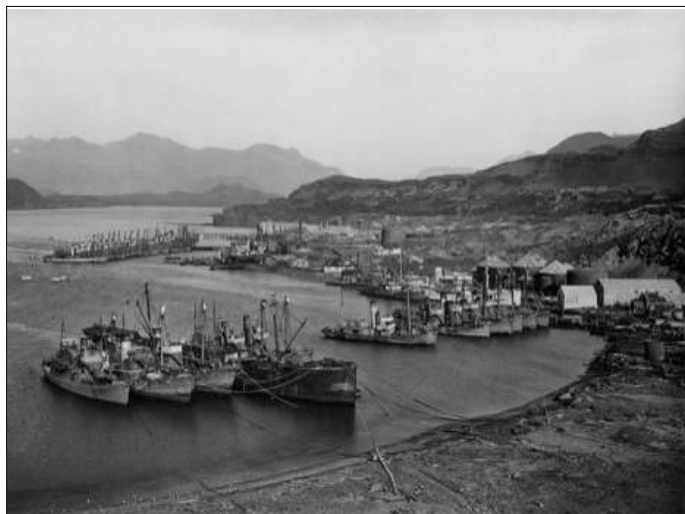
Leith Harbour, 1920s.

Leith Harbour survived the overproduction crisis of 1931, which forced some other land stations to close. This was due to the financial strength of Salvesen. Operation was able to continue because of the station's technical efficiency and its use as a forward base for Salvesen factory ships. Stromness whaling station was leased in 1931 and used for maintaining the company's whalecatchers.