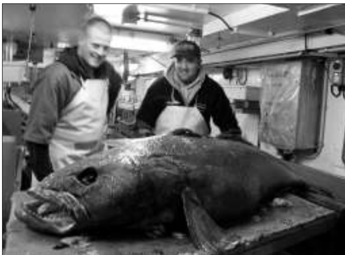
A toothfish more than 2 m long and 100 kg in weight brought into KEP from a fishing vessel. This is near the maximum size of the species.

Since the Commissioner's statement at the AGM, it has been announced that the South Georgia toothfish fishery has been re-certified as a sustainable and well-managed fishery. Originally certified in 2004, the fishery received an average score of 93% in its reassessment, making it the third highest scoring of the 52 current Marine Stewardship Council (MSC) certified fisheries.