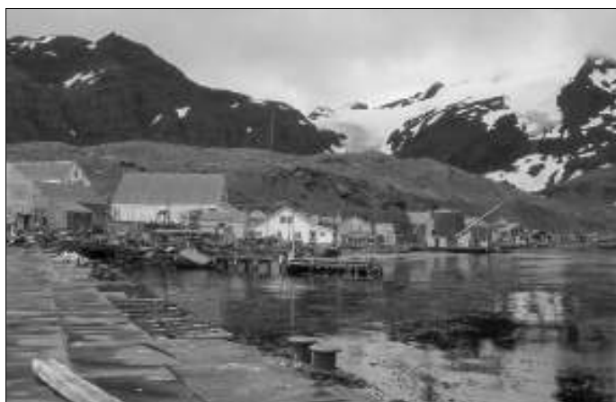
Leith Harbour, derelict.

Christian Salvesen has been taken over by the French company Norbert Dentressangle, whose trucks may be seen