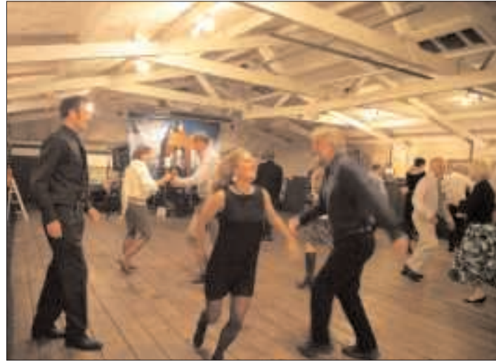
Not many of these revellers are thinking about industrial heritage.

to develop legislation for the protection of SGSSI's heritage.