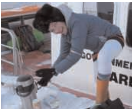
Olive Oyl takes it easy after her abduction and rescue.

KEP's award-winning film can be seen at: http://youtube/OXhZD3KxP1A