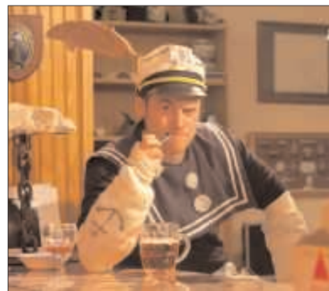
Popeye about to imbibe rapaciously.

This year the five elements were: the character Popeye, the sound of a dripping tap, a saw, the line of dialogue 'which I imbibed rapaciously' and a chocolate bar attached to a shirt.