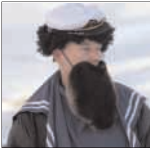
Bluto's beard appears to be an upside-down seal pup.

First category to be announced was Best Use of Elements. The Russians at Bellinghousen were the clear winners with their igloo-building masterpiece, the clever and beautifully filmed, 'Once In Antarctica'. Next was Best Screenplay which was closely contested but French Crozet Station pipped KEP with 'What if Popeye Was a Woman -