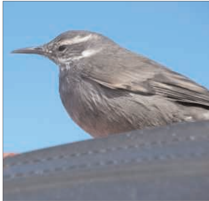
The grey-flanked cinclodes looking lost.

It is not so surprising that oceanic birds from distant places are seen in South Georgia waters. For several years now, a white-capped albatross has mated with a black-browed albatross on Bird Island and they have even reared