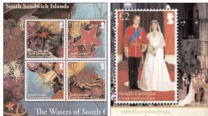
This year's stamps have a wide range of themes.