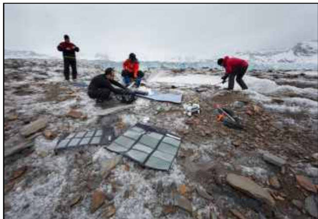
Preparing ice drill and solar panels for drilling on the edge of the Nordenskjöld Glacier.

ice on South Georgia. If the cores hold well-preserved records we also expect to be able to investigate them at sub-annual resolution, using our newly developed laser sampling technology to gain insight into what deep ice near the centre of South Georgia might hold for a climate record, in anticipation of proposed future ice core drilling.