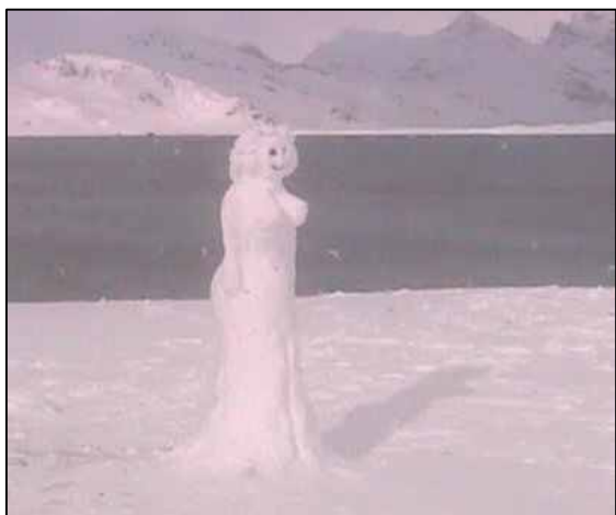
A screen shot captured from the KEP webcam last winter.