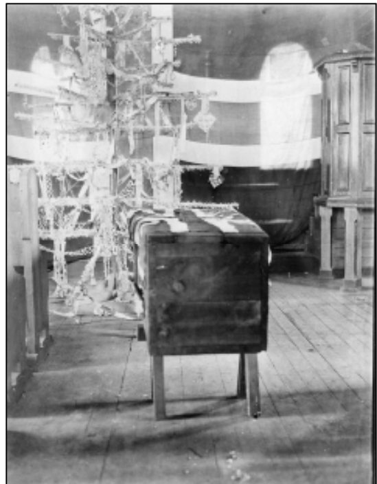
Shackleton's coffin in the Whalers Church. Christmas decorations are still in place.