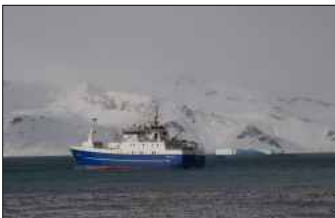
The longliner Argos Helena in Cumberland Bay.

For the second consecutive year the Director of Fisheries' toothfish licensing decisions were challenged in the courts. This Judicial Review process is both time-consuming and costly, but on both occasions the decisions taken by the Director of Fisheries were upheld.