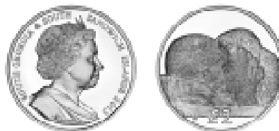
A new South Georgia £2 coin from the Pobjoy Mint depicts the pup of a Weddell seal.