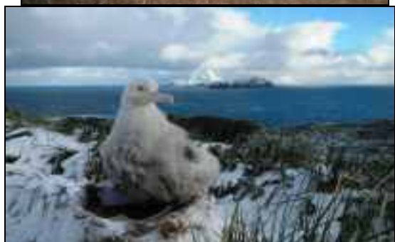
The chick a few days after rescue and a month later.