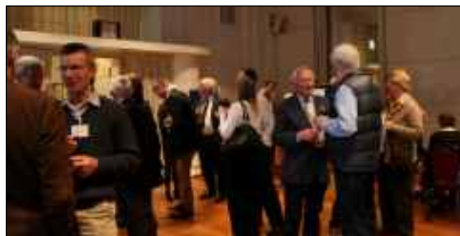
Catching up with old friends. A vital part of the meeting.