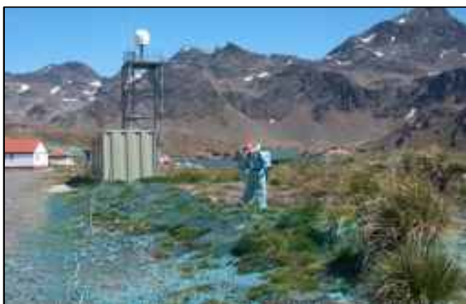
Blue dye marks where bittercress has been sprayed.

to be the bittercress around King Edward Point, but additional work has been undertaken at Grytviken and around the old whaling stations.