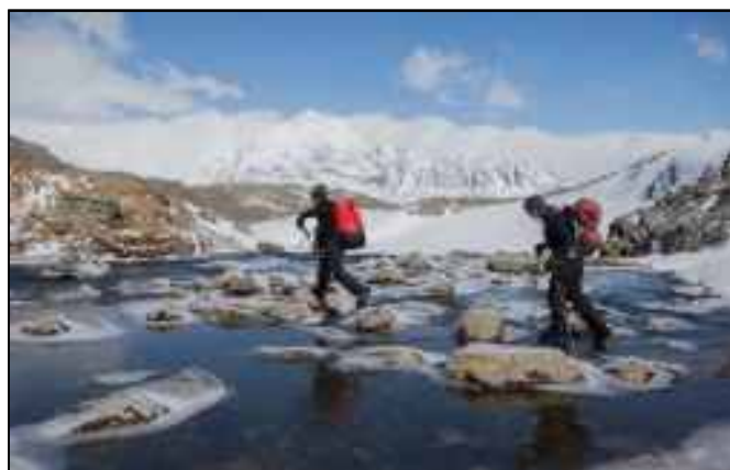
Approaching Szielasko Ice Cap, Barff Peninsula.

Meanwhile, the Barff team collected snow samples and conducted radar surveys on the Szielasko Ice Cap. A 2.7m snow pit was dug at the top of the Ice Cap (686 m asl) and sampled at 1 cm intervals to allow detailing of individual storm events. The winter snow at this elevation was starting to melt and the sampling stopped at 2.7m when ice was hit, indicating either significant melting of the pre-2012 winter snow or a hiatus between last winter's snow and possibly many years down to glacier ice.