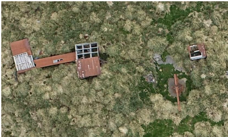
Fig 10. The gun emplacement on Hansen Point, Leith Harbour in 2020. To the right of the gun is the Observation Post with the rangefinder. To the left is the barrack with a covered passage leading to the magazine.

The two 4-inch guns are still standing outside the whaling stations. In February 1947 the Admiralty decided that the Royal Navy no longer needed them. They had been on loan and were now presented, with the stock of ammunition, to the Falkland Islands Government, to be maintained in working order in case South Georgia was threatened again. The old ammunition, which had been on the island for eight years without being checked, was disposed of at sea and fresh ammunition sent down.