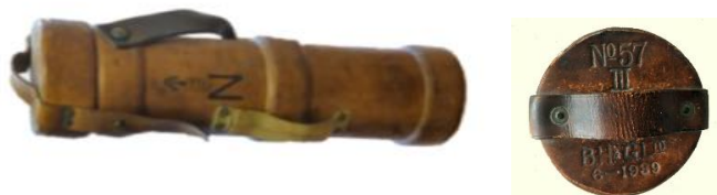
Fig 2. Cordite charges were carried to the gun in flash-proof leather Clarkson cases.

By late July 1940, 31 men at Grytviken had volunteered and the 'Pesca' head office in Buenos Aires was assured that this would not interfere with their work in the whaling station. It is, however, not known what role these men played in the defence of Grytviken. Many left the island soon afterwards to return home. Later, some were enrolled into the FIDF. This was made possible by the Oath of Allegiance in the Defence Ordinance (1920) being amended by replacing 'British subject' with 'person' and deleting 'and bear true allegiance'.