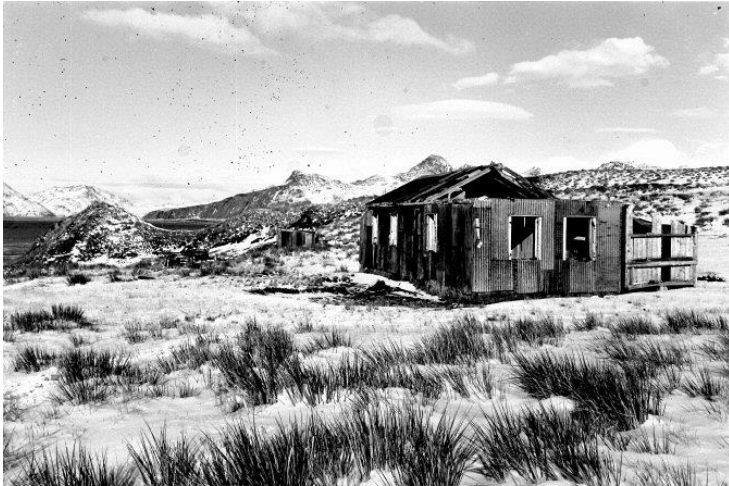
Fig 4. The accommodation hut on Susa Point with the gun and observation hut beyond in 1978.

working hours must have been spent on constructing the new gun site with the accompanying accommodation and magazine huts. At Grytviken, Allderidge ensured that that Shackleton's memorial cairn on Hope Point, which had been demolished as noted earlier, was rebuilt.