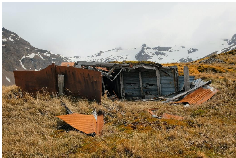
Fig 11. The ruins of the original gun shelter behind the whaling station at Leith Harbour. The doorway at the back leads down a passage to a small barrack.