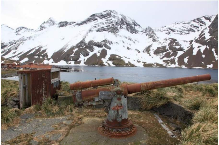
Fig 8. The Leith Harbour gun on Hansen Point in 2012 with the whaling station in the left background.