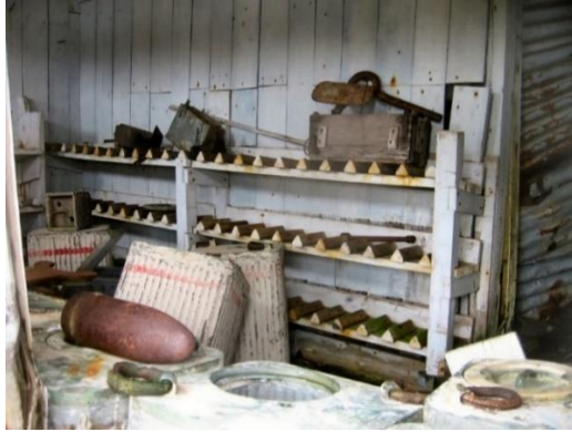
Fig 9. The magazine at Hansen Point in 2012 with a dummy practice round. (photo Robert Burton).

The two 4-inch guns are still standing outside the whaling stations. In February 1947 the Admiralty decided that the Royal Navy no longer needed them. They had been on loan and were now presented, with the stock of ammunition, to the Falkland Islands Government, to be maintained in working order in case South Georgia was threatened again. The old ammunition, which had been on the island for eight years without being checked, was disposed of at sea and fresh ammunition sent down.