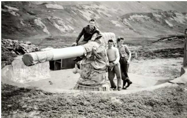
Fig 1. The gun at Hansen Point with its protective canvas wrapping.