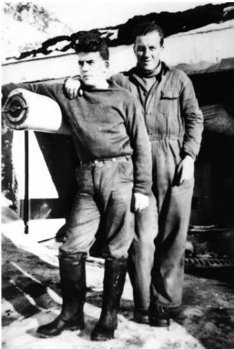
Fig 7. The Leith Harbour gun in the shelter of the original emplacement behind the whaling station.

Tammie Laurenson's orders from Fleuret included the scorched earth plan for Leith Harbour. It was recognised that the gun might be only a slight deterrent to an enemy so, in the event of an attack, the gun crew would prepare for action. The Magistrate would declare a State of Emergency and the demolition crew would stand by. If it seemed likely the station would be overrun, the demolition crew would blast holes in the fuel tanks and destroy wireless sets, ammunition and anything else that would benefit the enemy. For this, they had been supplied with demolition charges and 'tarbaby' incendiaries for setting fuel oil alight.