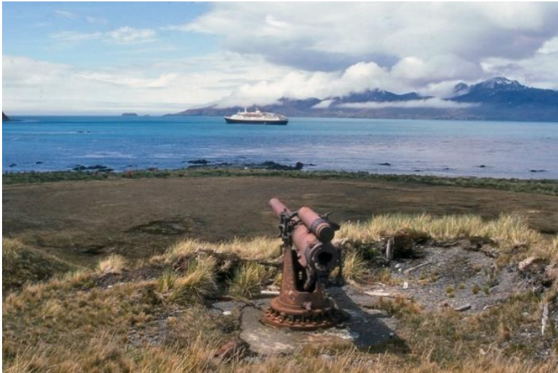
Fig 5. The gun on Susa Point commands the approaches to King Edward Cove.

propellant was carried in a cloth bag rather than a brass cartridge case attached to the shell. To prevent the charge being ignited accidentally by a stray spark from flashback, it was carried from the magazine to the gun in a leather Clarkson case.