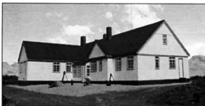
Discovery House refurbished

A considerable amount of work has taken place at King Edward Point. The demolition work is now complete and the Point is looking immaculate. Larsen House has been brought up to the standard of the research station and its accommodation block. Discovery House has been renovated and all the asbestos removed and disposed of to UK specifications. We are now working towards a plan for the most appropriate use of this important building. Our initial ideas are that it should be used as a venue to celebrate the Discovery Expeditions in a high standard interpretative fashion, allow BAS an area for them to show the work of the fisheries laboratory and the broader BAS sphere of expertise. Our aim will be to demonstrate the success of the combined efforts of the FCO/GSGSSI/BAS in managing the South Georgia environment in a sustainable fashion. We are also considering an eventual move of the Post Office to Discovery House.