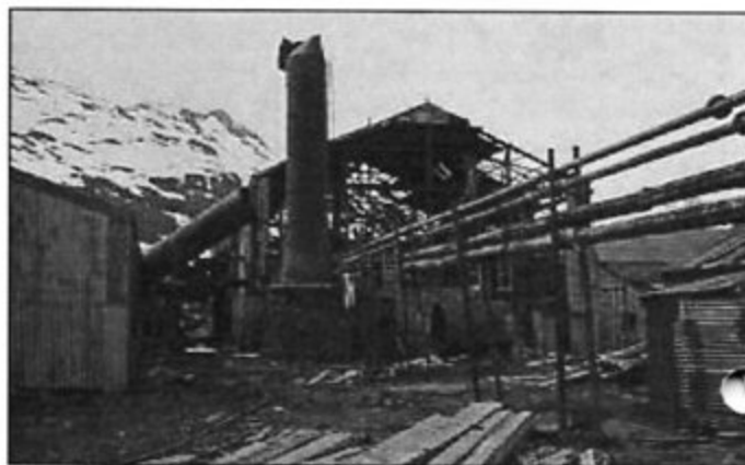
The whaling stations are collapsing

asbestos at Grytviken and I suspect this will be our main priority for the next two years and more. The former whaling station at Grytviken is deteriorating very rapidly. It contains a number of hazardous substances. These include asbestos in several forms, PCBs and old bunker oil residues. The asbestos is the most immediate problem as it could affect the safety of staff and visitors. We are presently conducting regular air sampling to ensure that the areas visited and lived in are safe for those purposes.