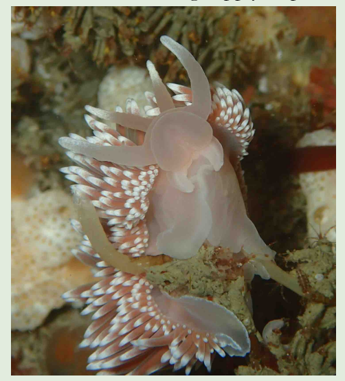
A nudibranch, Flabellina sp.

Below are a selection of underwater images from shallow water around South Georgia, taken during a scubadiving trip on the Golden Fleece in 2016. Most dives were in sheltered bays on the north coast, including a dive on the wreck of the whaling supply ship, Ernesto Tornquist, which sank in 1950.