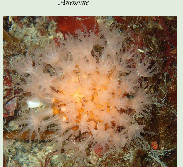
Soft coral (Octocorallia): probably Anthomastus