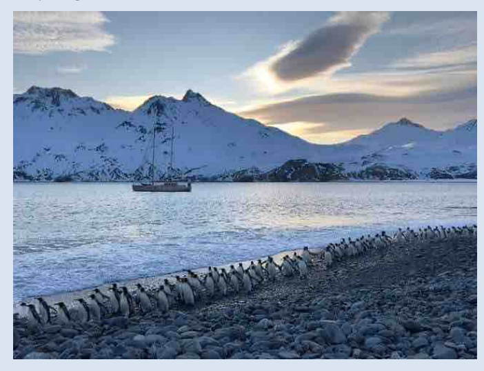
The Vinson of Antarctica in Fortuna Bay

The next five days we were blessed with some of the best weather I have experienced on South Georgia, the wind dropped, and the skies became blue and clear. The snow conditions were near perfect and the glaciers excellent to travel on. We were even lucky with the calmest weather ever for putting our tents up. Despite this good weather I was still very keen on making sure the tent valances were covered with snow blocks, you never know what South Georgia may throw at you in the middle of the night.