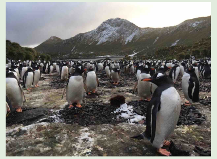
The gentoo colony in evening light

It has been an incredible winter, with the best possible people, however spring has now well and truly sprung on the island. The new team has arrived, the beach is full of big male fur seals and the number of pups on the beach is increasing rapidly. Meanwhile on Main Bay our eight elephant seal pups have rapidly turned into weaners and appear to be doing well. The black-browed and greyheaded albatrosses are all now sitting on eggs, the wandering albatross chicks are starting to fledge, the northern giant petrels are hatching and the brown skuas and white-chinned petrels have started laying too.