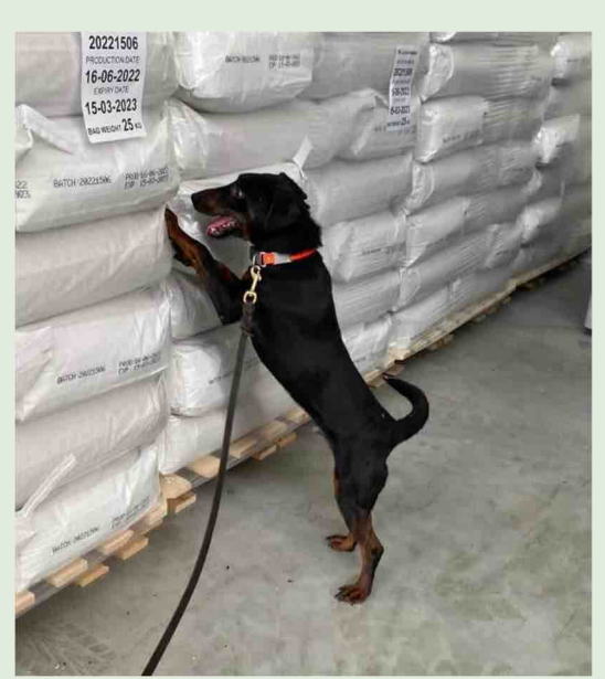
New biosecurity dogs (p 5)