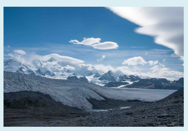
The Lönnberg Valley with the Nordenskjold Glacier in the background.

This Terrestrial Protected Area covers over 3,800 km<sup>2</sup> and complements the Marine Protected Area which covers the whole 1.24m km<sup>2</sup> maritime zone, thus ensuring that the whole of SGSSI lies within a protected area system. Together, these Protected Areas will be an exemplar in delivering holistic ecosystem management, sustainable use and world-class protection.