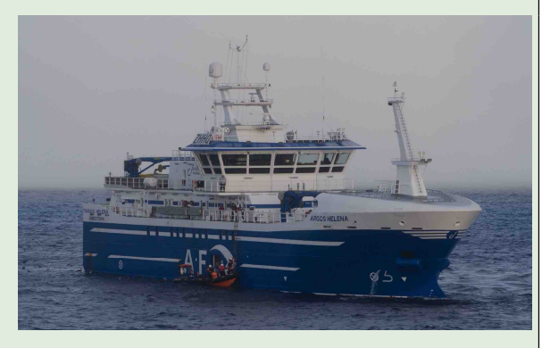
FV Argos Helena being inspected during the 2022 fishing season.