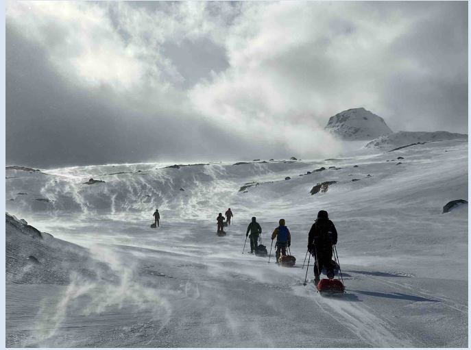
Departing Peggoty Bluff

Time to start planning the next South G trip!