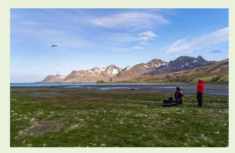
RPAS in flight at Husvik, 4 November 2022