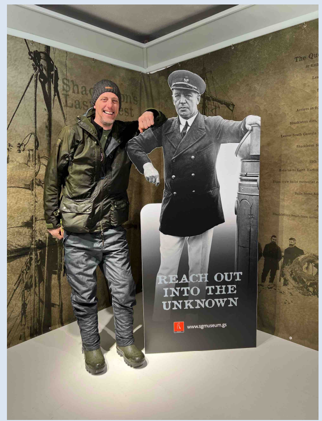
The author in the South Georgia Museum