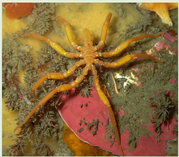
A sea spider (Pycnogonida)