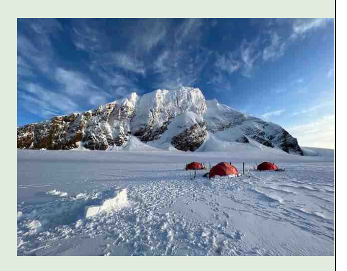
The "Alternative Shackleton" route across South Georgia (p 6-7)