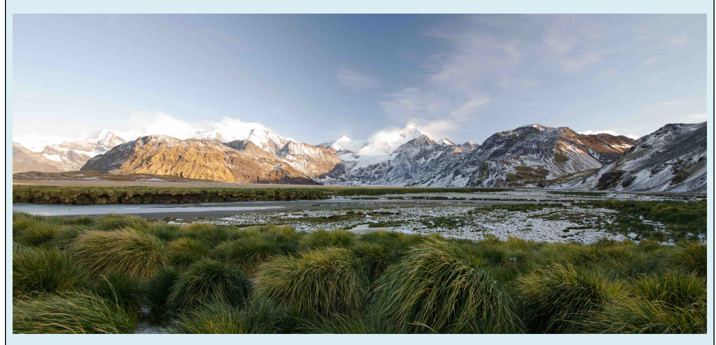
Looking across Penguin River towards Hestersletten, with Mt Paget in the background.

Within the next 12 months, GSGSSI, in partnership with stakeholders, will develop a detailed management plan and enhanced regulations for the Protected Areas to ensure that the unique terrestrial ecosystems in the Territory enjoy the high level of protection they deserve.