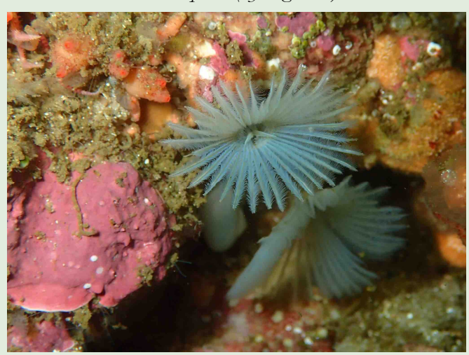
Tube worms probably Perkinsiana sp.