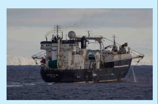
Krill fishing vessel operating north of South Georgia

However, most of the information we have on krill, and the ecology and behaviour of key krill-dependent predators originates from the austral summer, whilst the fishery operates exclusively during winter. There is, therefore, a disconnect. The emerging issue with this is the concentration of the fishery on the eastern shelf of South Georgia coinciding with the foraging grounds of Antarctic fur seals and gentoo penguins, which do not fully disperse during the winter. Recent work suggests these predators may extend their foraging ranges beyond the NTZ, leading to direct competition with the fishery, which may be exacerbated further in poor krill years. Another issue is that we are now seeing the return of baleen whales, who also rely on krill for their food, yet there is still uncertainty about how many remain over the winter. The importance of these factors is raised by increasing fishery catches over the last two decades, which have the potential to exacerbate the effect of environmentally-driven pressures on krill populations.