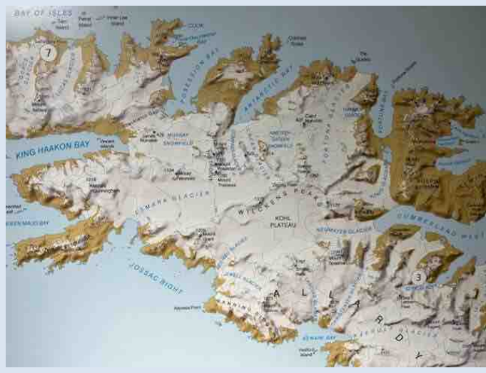
Map of the crossing from King Haakon Bay to Cumberland Bay

The route took us up the Briggs Glacier, past the Trident and onto the top of the Esmark Glacier. Then through Zig Zag pass and onto the Kohl Plateau before crossing one final pass onto the König Glacier. This pass was challenging, it was very steep and icy on the Kohl Plateau side and a vertical rocky cliff on the König Glacier side. It took a while to cross this pass using ropes, pulleys and ice screws to heave the pulk sledges up the steep slope and down the rock face (4 hours to be exact and from then onwards was known as 4 hour pass). As crossing this pass slowed our progress and the day was closing, we camped for the night just down from the pass.