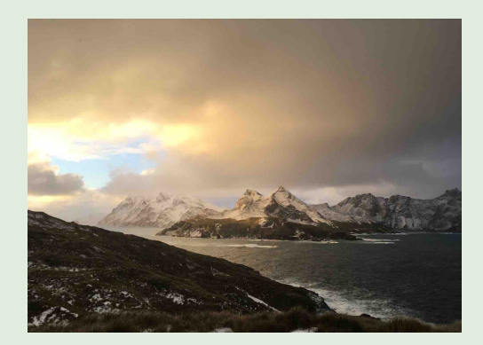
Sunrise over South Georgia