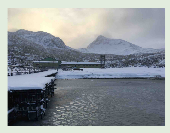
Bird Island research station in winter