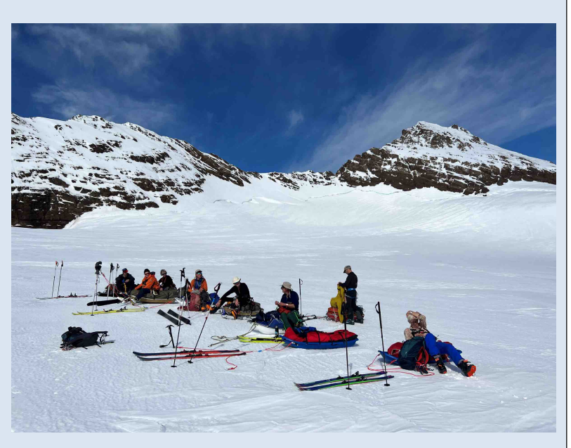
A break before tackling Zig Zag Pass