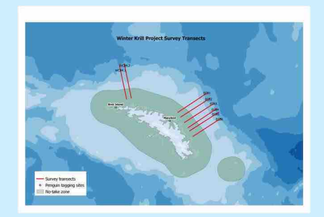
Location of acoustic transects

Finally, working with the ART, who are providing the project with 12 Wildlife Computer satellite tags each year, we deployed 6 satellite tracking tags on gentoo penguins at both Bird Island and Maiviken (near KEP). Four tags were deployed at each site in advance of the May survey, and a further 2 were deployed at each site in July. At the time of writing (Oct 2022), 5 tags were still transmitting data, providing an unparalleled insight into foraging behaviour throughout winter and beyond. Added to this, we are also receiving high resolution tracking data from remote-download GPS tags deployed on seven further gentoos at Bird Island.