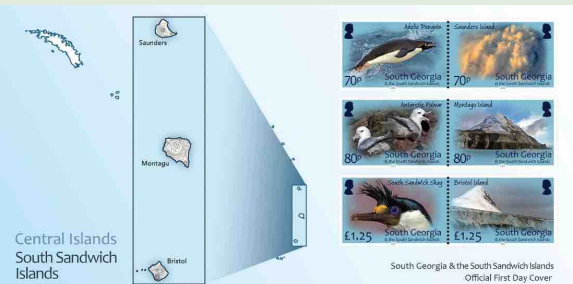
First day cover of the South Sandwich stamp issue

For those interested in the South Sandwich Islands, a special issue of Deep-Sea Research was published in early 2022 and features 12 papers on oceanography, ecology and fisheries. Most of the papers are open access and available at: <a href="https://www.sciencedirect.com/journal/deep-sea-research-part-ii-topical-studies-in-oceanography/special-issue/10C3G0D4N5Q">https://www.sciencedirect.com/journal/deep-sea-research-part-ii-topical-studies-in-oceanography/special-issue/10C3G0D4N5Q</a>