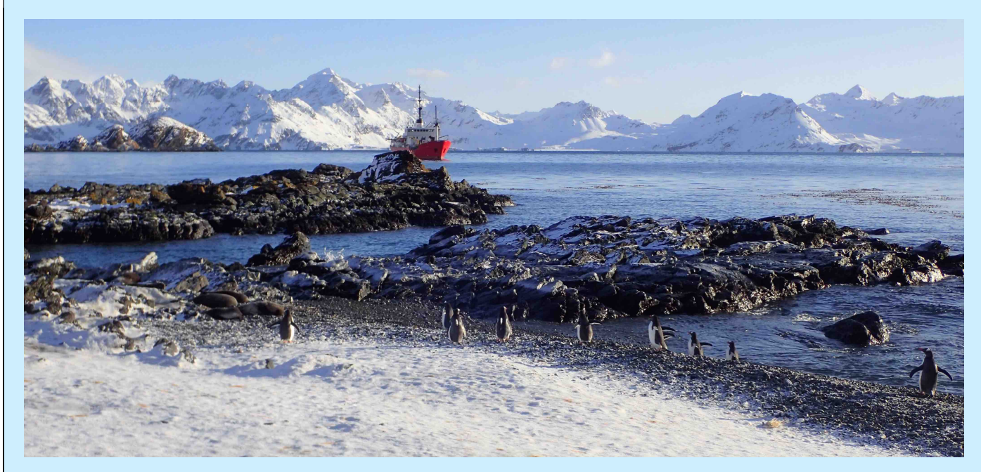
Gentoo penguins at Maiviken; note the two tagged penguins in the centre and Pharos SG in the background.

For further information or to join our stakeholder mailing list, please email ceclis56@bas.ac.uk or macol@bas.ac.uk