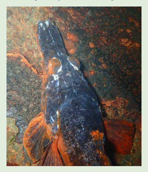
Crocodile fish, Parachaenichthys, camouflaged on the wreck of the Ernesto Tornquist