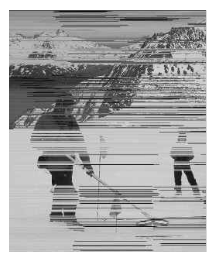
Searching for the Primus. South Georgia's Holy Grail?

A group of about 12 spent 10 days searching for Shackleton's Primus stove which was jettisoned in 1916 just below Breakwind Ridge above Fortuna Bay. They carved out a platform for four tents and searched systematically for the elusive stove with a special metal detector. However, it was not powerful enough to penetrate the 2.5 metres of winter snow and then into the ice in which the stove is believed to buried. So the stove is still in its icy tomb.