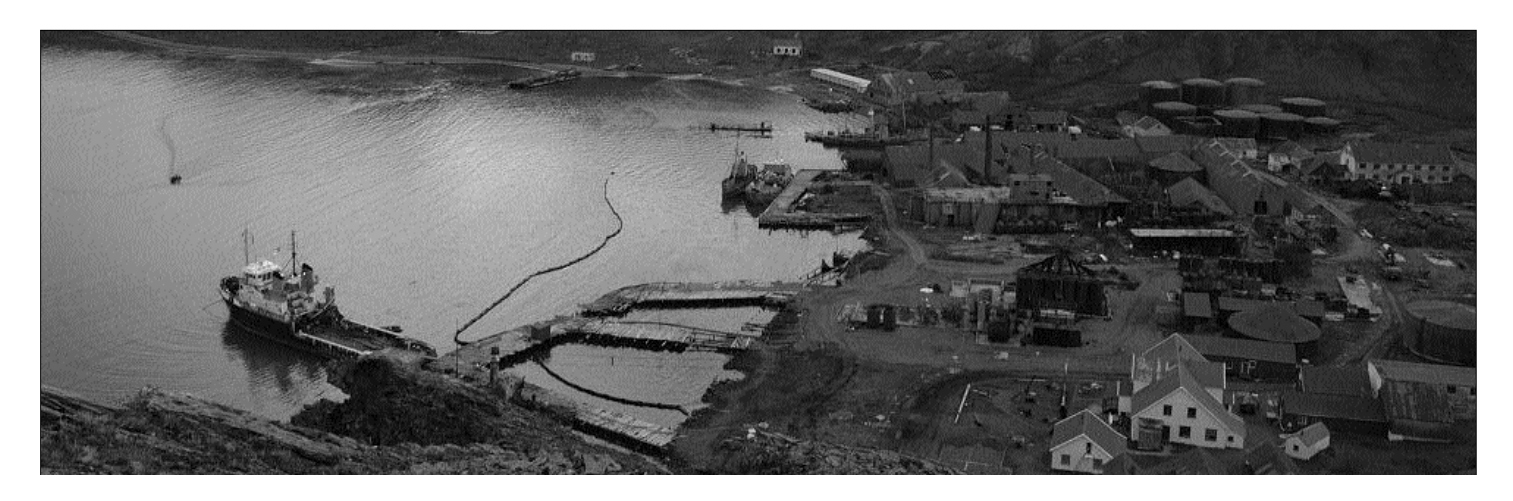
Grytviken at the end of February. Dias is afloat alongside a barge at the Tijuca jetty. The plan has been cleared away and the blubber and meat cookeries and boiler houses are exposed. At the far end of the station, beyond the meat freezer, stands the temporary accommodation and offices for the AWG workforce.

Work on clearing-up and making safe of the Grytviken whaling station was started last September when a small party of 10 men arrived with considerable amounts of plant and equipment. Their first task was to build the accommodation camp complete with generators, two-man cabins, kitchen, freezers etc. In October the main party of about 30 men arrived. A specialist decontamination unit was built for the asbestos removal team and the real work began. The intention was to remove asbestos, oil residues, old gas cylinders, possible PCB-contaminated oils and other hazards. The remit was to leave the station, with as much of the plant intact, in a reasonably safe state for visitors.