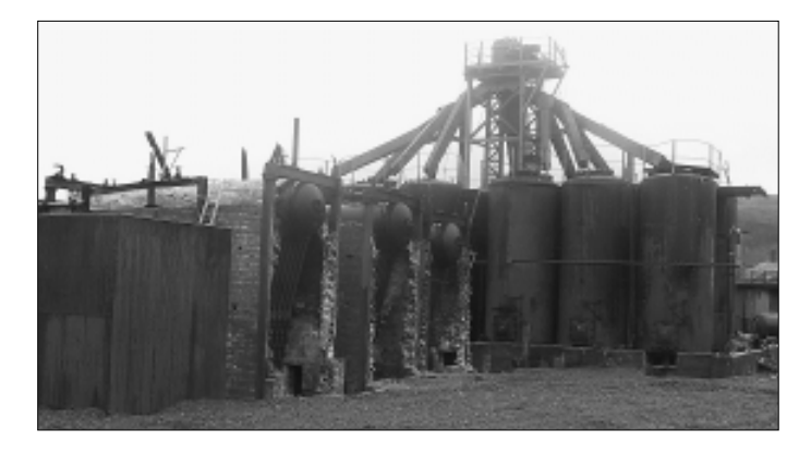
Boilers and blubber digesters are exposed to the public gaze.

A small amount of residual furnace oil was removed from Petrel's bunkers. Then a big excavator was used to dig away a small part of the shore in front of her old position at the former slipway and she was drawn forward until her keel was level with a flat area of sea bed and her bow hard against the shore. She was stabilised by putting beach material around her bow and about a third of her length back and water was pumped back into her so that she lies on the bottom in a fully upright position with her decks remaining above water. Dias was next to be raised. This was a much more difficult task due the very thin plate on her hull and the many holes. Divers worked constantly for a week or more to patch her hull sufficiently to pump her and bring her to the surface. Her tanks were then cleaned out. Our salvage consultant on site has said that she is so thin she cannot be towed out of Cumberland Bay. The only way to move her further is with a lifting ship. I mention this because her history as a steam-powered trawler (still having her original engine), active service in the Great War and