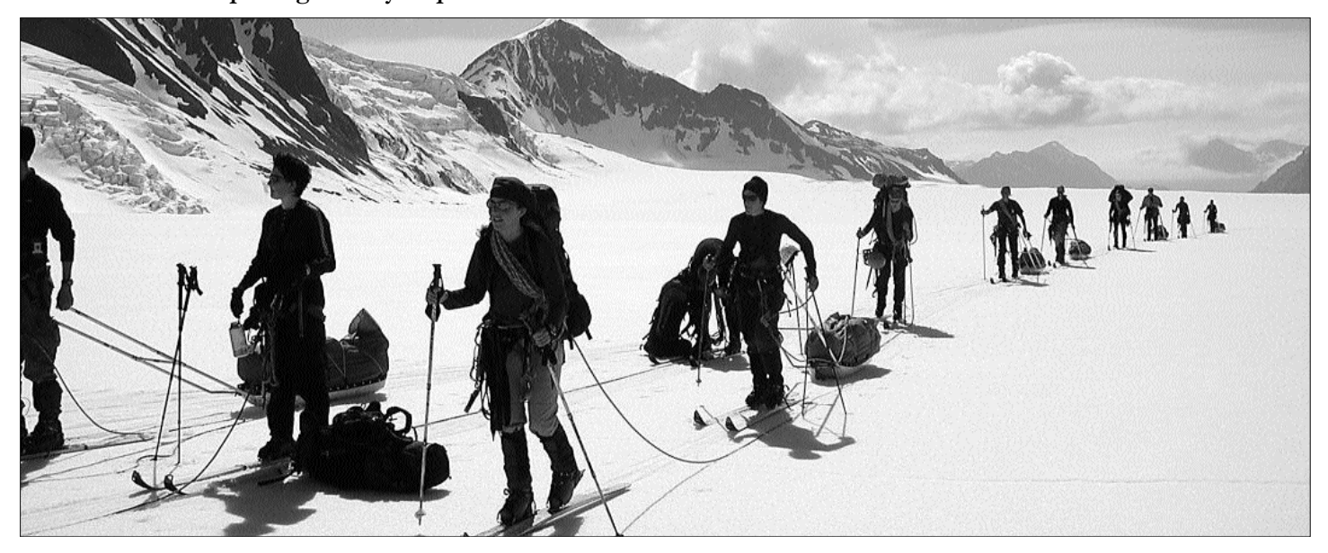
Travelling with pulk sledges on the Upper Neumayer Glacier.

This successful expedition returned from South Georgia in January. The party of 21 young explorers (YEs), ages 18 to 24, six leaders and three assistant leaders had undertaken an extensive programme of adventurous excursions and scientific projects, not only on the Island but earlier in southern Chile and the Falkland Islands.