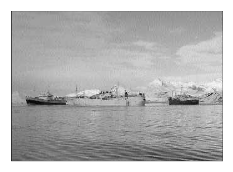
Three longliners wait in Cumberland Bay East to be checked by the marine officer before receiving their licences. The middle ship is Moresko I which was later werecked off Moraine Fjord.