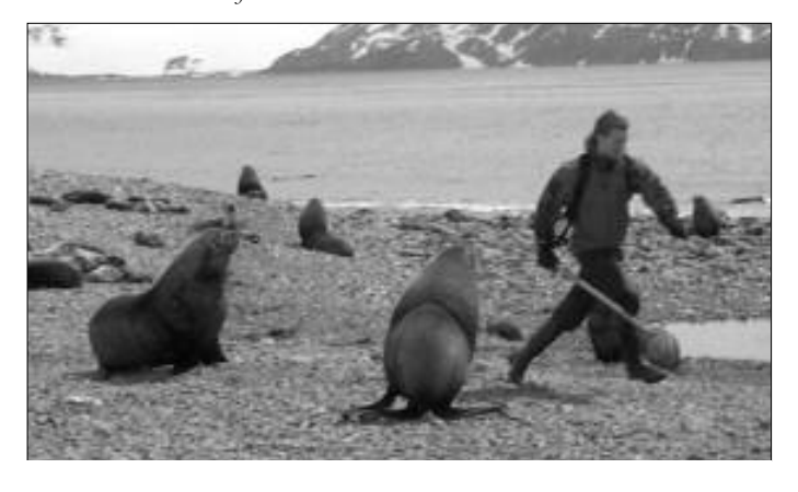
Finn McCann avoids fur seal bulls.

seals of South Georgia. The most impressive beach then had been St Andrew's Bay, where at the height of the season we counted over 6,000 female elephant seals and more than 650 bulls. This time most of the elephant seals had departed for sea, although there were still plenty about, and loads of weaners. What were even more abundant than last time were king penguins. They were everywhere. Vast congregations of chicks and adults, promenading about and enjoying the spectacular scenery. Some of the scenery had changed too. The snout of the Heaney Glacier had reached the sea as a cliff when I first saw it in 1976. In 1985 it was a ramp about 100m from the shore. Alun Hubbard measured its distance from the shore this time and found it to be 2.5km. That's some retreat.