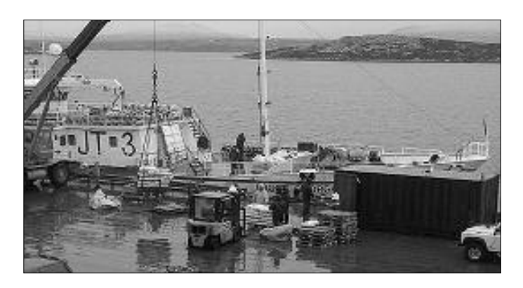
Unloading toothfish from the Argos Georgia at Stanley.

Incidentally, during last season's fishing by eight vessels, not a single flying seabird was caught in the South Georgia longline fishery. The only casualty was a gentoo penguin which was snagged and drowned. The Government of South Georgia and its officers are to be congratulated on their success at regulating the fishing industry. If only the simple but effective techniques of keeping albatrosses away from the baited hooks could be applied worldwide! Until they are, South Georgia's albatrosses will not be safe.