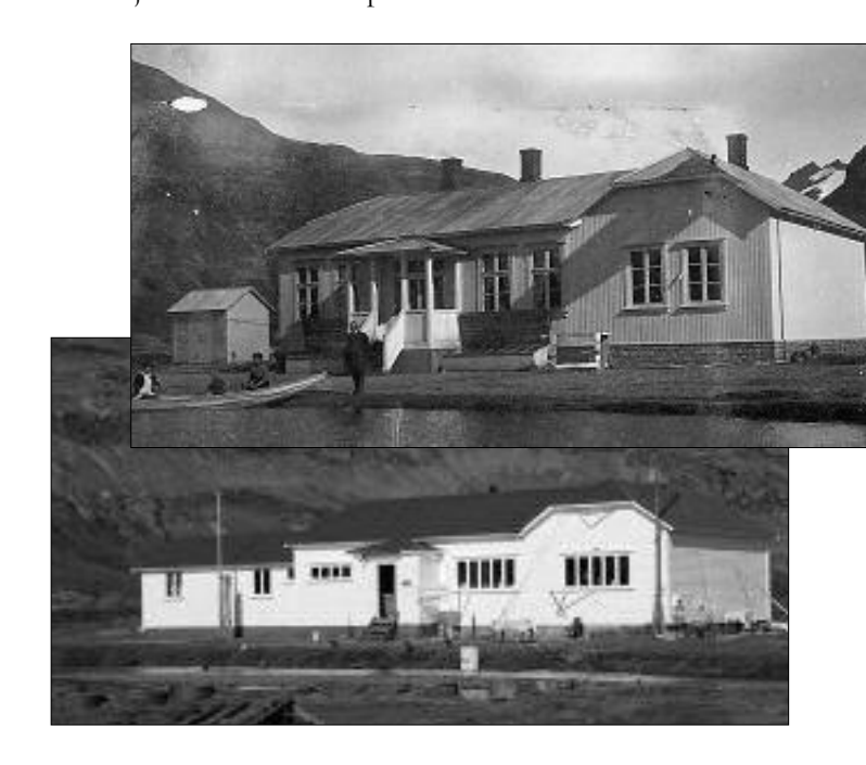
Husvik Villa: In the early days and after restoration..

Like other buildings in the whaling stations (including the Grytviken Villa), the Husvik Villa has been becoming dilapidated. Through the South Georgia Heritage Trust, this has now been remedied thanks to the generosity of the Norwegian county of Vestfold, where the Norwegian whaling industry was centred, the municipality of Sandefiord and local companies.