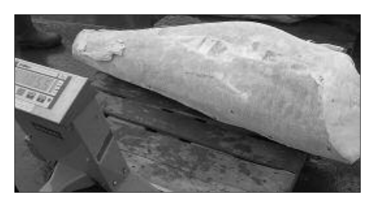
A toothfish 'trunk' - topped, tailed and gutted. It weighs 105.5kg and is worth up to £1,100 at the quayside.