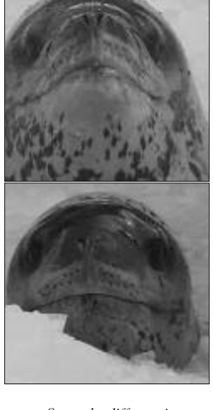
Spots the difference!

Bird Island is famous for its albatrosses and fur seals but anyone lucky enough to overwinter knows that this is a good time to see leopard seals. To get a better idea of how many come to the island, individuals are being identified by the unique patterns on their heads. This is a development of a programme of tagging leopard seals. Last year the winter population was estimated at around 80. (Harry Clagg, the entomologist on Lance Tickell's overwintering party in 1963, painted numbers on about 20 leopard seals.)