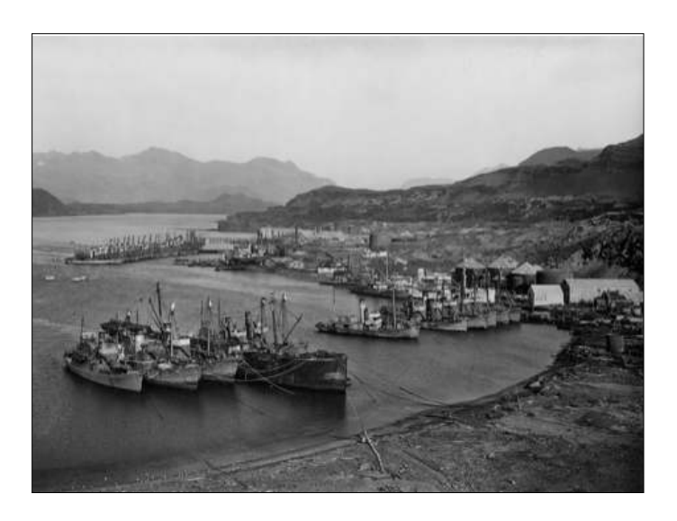
Leith Harbour, 1920s.

Leith Harbour survived the overproduction crisis of 1931, which forced some other land stations to close. This was due to the financial strength of Salvesen. Operation was able to continue because of the station's technical efficiency and its use as a forward base for Salvesen factory ships. Stromness whaling station was leased in 1931 and used for maintaining the company's whalecatchers.