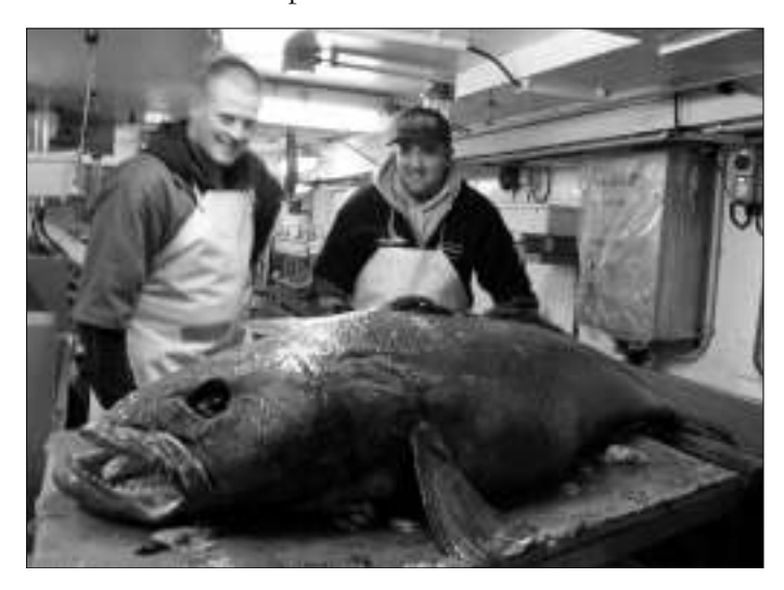
A toothfish more than 2 m long and 100 kg in weight brought into KEP from a fishing vessel. This is near the maximum size of the species.

Since the Commissioner's statement at the AGM, it has been announced that the South Georgia toothfish fishery has been re-certified as a sustainable and well-managed fishery. Originally certified in 2004, the fishery received an average score of 93% in its reassessment, making it the third highest scoring of the 52 current Marine Stewardship Council (MSC) certified fisheries.