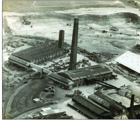
The brickworks, Sussex.