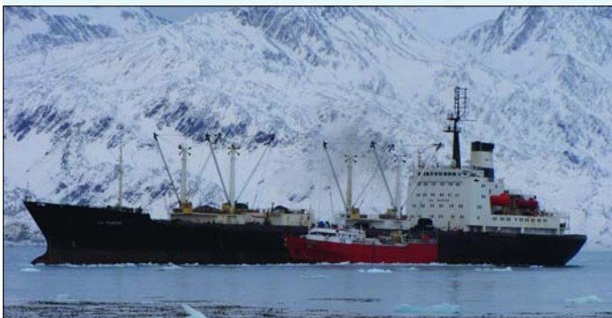
A longliner unloads its catch onto a reefer in Cumberland Bay.

2009 was an extremely poor krill year at South Georgia, which was reflected in poor breeding success of many krill dependent predators in the 2008/09 season and a reduced