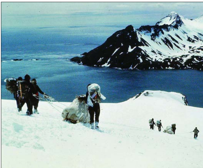
Descending the slope above Fortuna Bay.

snow. The mountains rose 3-4,000 ft above us, their summits covered in huge 'mushrooms' of rime ice, deposited by the cold and damp winds. They looked almost like top-heavy ice creams, and were very beautiful in an awe-inspiring way. Could Shackleton have enjoyed even a moment to gaze about him in such scenery? I like to think that even after all his tribulations he could have done so.