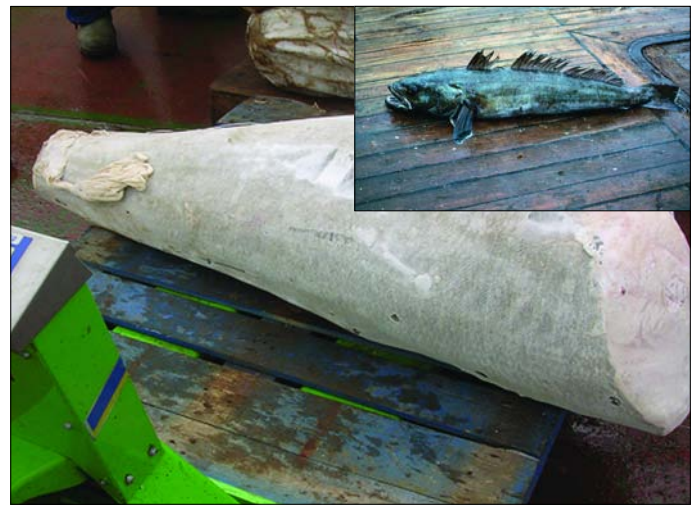
Toothfish: the 'white gold' that funds South Georgia.

The GSGSSI strategy will lead to a revised Environmental Management Plan. We did note that Cultural Heritage was not given the attention that we believe it should have received in the Strategies. Not surprisingly, it is overshadowed by the emphasis on the Natural Heritage and the plan to restore the island's habitat by eradicating rats. But the Territory's Fishery is the main focus for the Government. Its greatest income is from the South Georgia fishery. In 2009, fishing was responsible for 78% of income (of which toothfish made up 85%). However, at 56% of total expenditure, the industry also has greatest expense to manage and monitor. This dependence on fishery is a key concern.