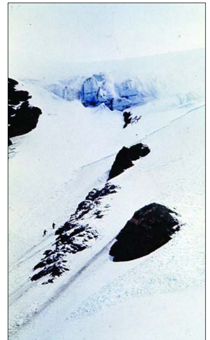
Descent to Fortuna Bay, with avalanche.

By the end of the crossing, my respect for Shackleton had grown even further for the accuracy of his descriptions, especially when one considers the circumstances of this journey. He was constantly accurate in his assessment of distance but less so in height, although even here it was by a constant factor. The three men were after all sailors not mountaineers, and had spent almost two years within a few feet of sea level. I found it all hugely impressive – perhaps the more so because of my training as a surveyor. When, I wondered, did he write it down? And how was he to know that anyone would ever retrace this route? It could have been so easy to exaggerate. But the fact that they did not makes me admire them all the more, and leads me to believe Shackleton's description of events elsewhere in his story, rather than others when they differ.