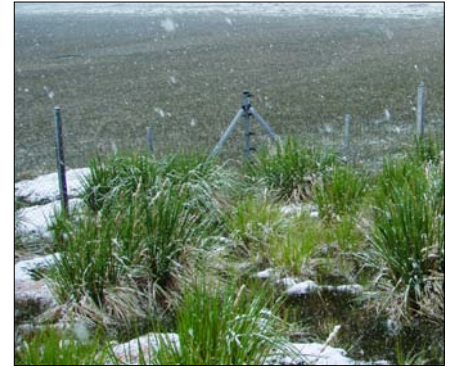
Contrasting vegetation inside and outside an enclosure.

The SGHT has been discussing monitoring the restoration of vegetation after rat-eradication. The point was made that programmes would need to be in place before any reindeer were removed so that baseline data would be available.