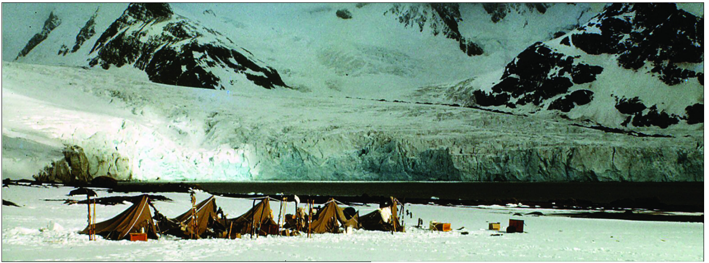
The start: Camping at the head of King Haakon Bay.