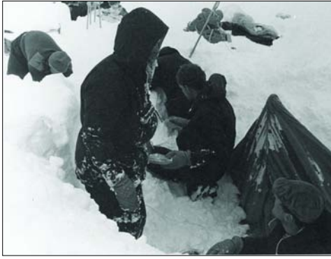
Digging out the camp after a heavy fall of snow.