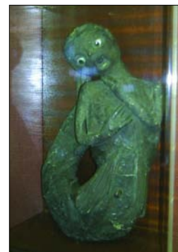
The Hull mermaid.