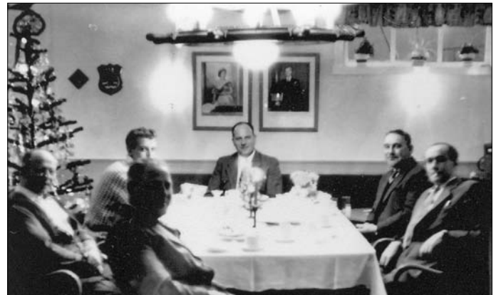
It was a joyous meal!