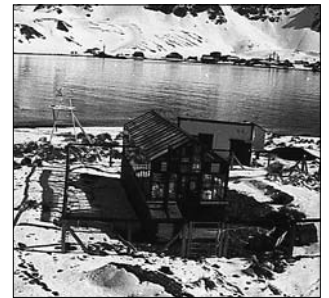
The greenhouse, South Georgia.