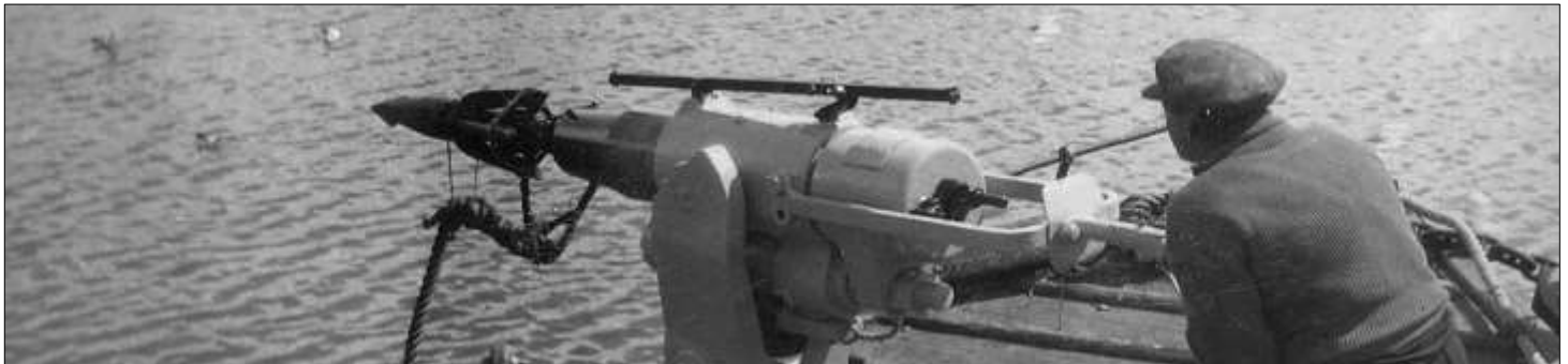
A harpoon cannon ready to fire. The gunner or 'skytter' (pronounced 'shooter') takes aim along the sighting rod.

The Spring Meeting & AGM will be on April 20, 2018