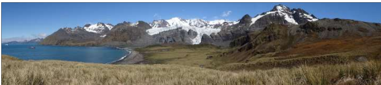
Overlooking Gold Harbour, with Pharos SG awaiting the return of the field team.