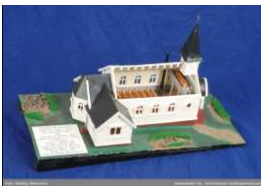
A model of the church in Sandefjord Museum.

We returned on 18 March after a, relatively, calm crossing aboard the Pharos SG !