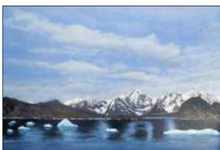
Cumberland West Bay