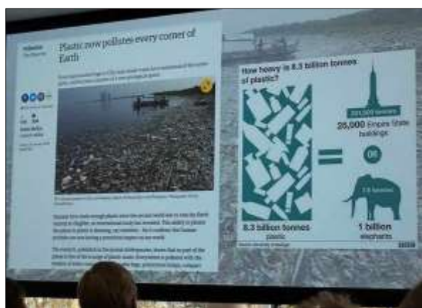
The plastic horror story.