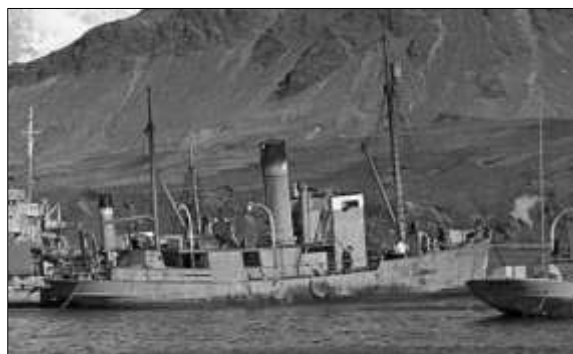
A sealer with a palisade of corrugated iron sheets to hold the deck cargo of blubber.

Examination and analysis of the accumulated plankton samples gave me many days work in the lab, for the winter blizzards often kept us indoors. I examined some hundreds of krill samples from whale stomachs and was astonished to