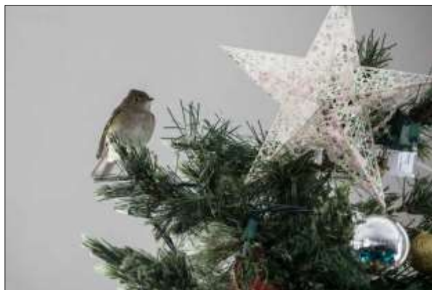
A unique photo of a white-crested elaenia. (Steve Rose)

Originally we assumed it to be a South Georgia pipit, the only songbird breeding on South Georgia, but it revealed its true identity by flying through the open door into the bar-lounge during lunch! It was a white-crested elaenia, a small tyrant-flycatcher normally found in woodland in places like Ushuaia on the Argentine mainland. (I have frequently seen the species in that area). As it flew round the room, it sought refuge several times in