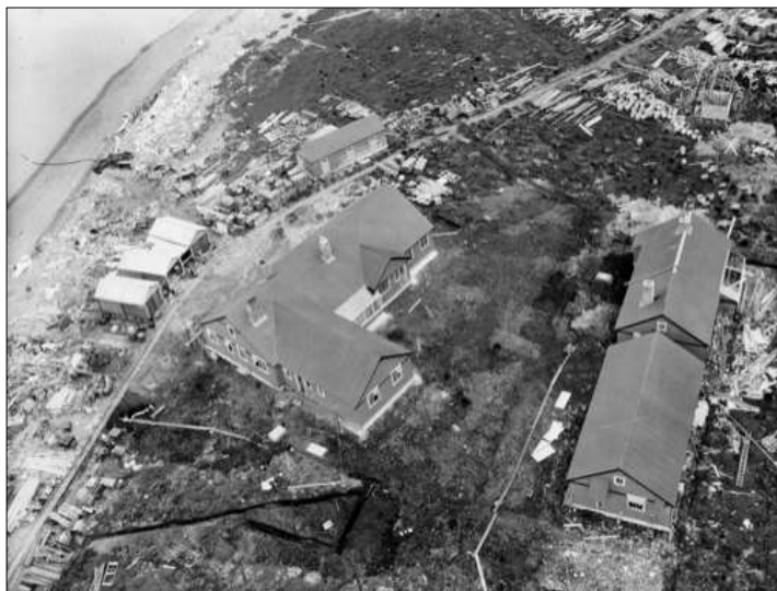
Newly-built Discovery House from one of the wireless masts.

By 20 January 1925 the roof [of Discovery House] was on and the living quarters good enough for us to move in, but it was not until 20 February that we could throw a house warming party and it was early April before we had the laboratory complete and furnished. Hunter was afflicted with any number of frustrations and set-backs with his target dates for getting the buildings finished and sometimes got into a mood of deep depression which led someone to propound the 'Principle of the Futility of Endeavour - the more you try the less you succeed'. He was not amused.