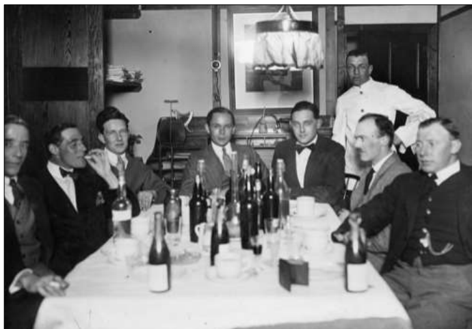
Civilized life in Discovery House.

Whenever the weather allowed and I could get one or more of the others to crew her we worked all around East Cumberland Bay. We even managed vertical plankton hauls from as much as 90 fathoms, closing the net with a messenger at fifty or sixty. As no closing gadget had been sent out I devised and made a simple one that worked so well that it was later adopted as the standard mechanism used in the Discovery .