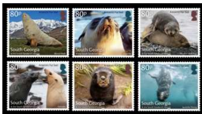
The recent issue of fur seal-themed stamps.

(grant aided by the Darwin Initiative through UK Government funding)