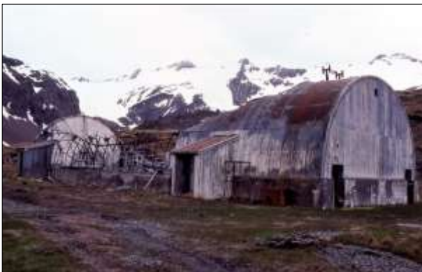
The Kino at Leith long after closing down.

The four principal whaling stations (Grytviken, Leith, Stromness and Husvik) each had a Welfare (Velferden) Committee which organised various entertainment and sports activities. Inter-station winter sports competitions were also popular. Each station committee was also responsible for managing a well-stocked library. In addition, the four stations had a cinema or Kino in which films were regularly shown, most probably on Saturday nights; they also doubled as theatres, sports and meeting halls.