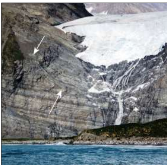
One of Tom Sharpe's images showing the principal fold structure (marked by arrows) beneath the remains of the Bertrab Glacier.

I plan to write a proper scientific note about all this but, in the meantime, all the background is in Stone, P. 1980. The Geology of South Georgia: IV. Barff Peninsula and Royal Bay areas. British Antarctic Survey Scientific Reports, No. 96. Available online at nora.nerc.ac.uk/509189/ . And strictly for geology buffs ... the axial planes of the tight, overturned fold pair at Gold Harbour are almost parallel to the overall bedding attitude, but the upper fold hinge is partially sheared out by movement along that plane. The asymmetry implies top-to-the-NE tectonic movement consistent with the thrust-emplacement direction of the Cumberland Bay Formation as defined by evidence seen elsewhere in South Georgia.