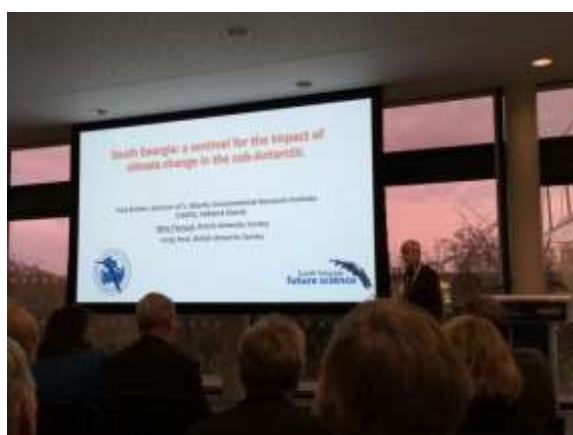
The importance of South Georgia in climate change studies.