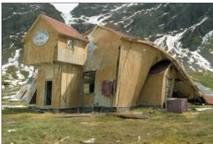
The Grytviken Kino before its final collapse.