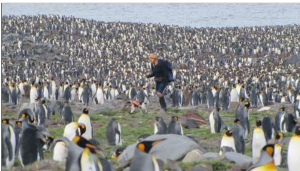
Will, with Miriam, checks out the King Penguin colony in St. Andrews Bay. Showing single-minded diligence, he is ignoring thousands of interesting penguins and concentrating on finding the elusive odour of rats.

(Based on a Press Release.)