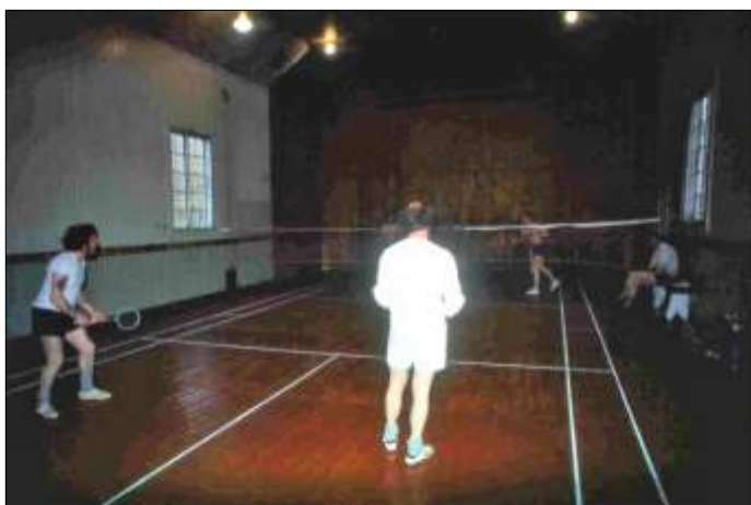
Badminton in the Grytviken Kino, 1976.