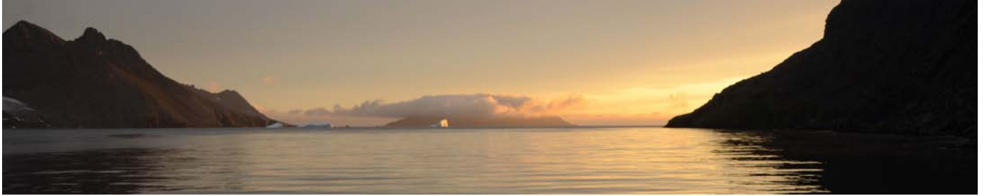
Cooper Island from the entrance to Larsen Harbour in Drygalski Fjord