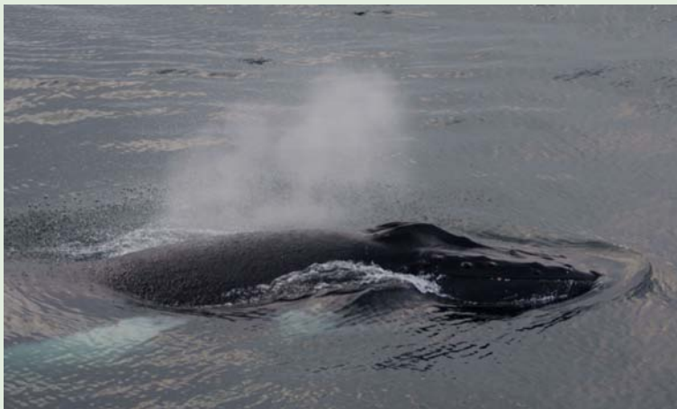
Return of the whales to South Georgia (see page 6)