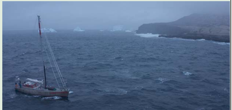
Pelagic Australis off the coast of Zavodovski – conditions were too rough to land, so drones did the work.

Leaving Stanley after Christmas, we had an enjoyable and swift crossing – a glass of champagne and a cup of tea at change of watch on New Year! On the sixth day, the cone and plume of Saunders Island grew on the horizon towards dusk. Humpbacks feeding around us were a reminder of how rich in krill the islands are; they support over 4 million chinstrap penguins. By the time we’d crept into Cordelia Bay avoiding known shallows it was pretty dark, but you could still make out some of the larger parts of the colony even 300 m offshore in darkness it was clear that we were back – 200,000 chinstraps are never silent!