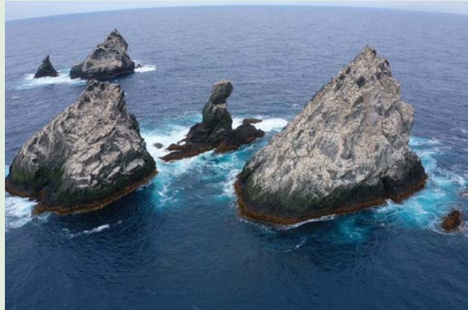
Shag Rocks - an aerial survey on the voyage back will be used as a baseline count for a project that will continue via citizen science.