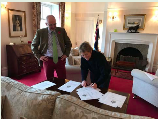
New Magistrate for KEP (see page 3)