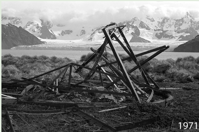
Fig. 4. The remains of the astronomical observatory in Moltke Harbour occupied by the 1882–1883 German IPY Expedition. In the background, seen across Royal Bay in early December 1971, is the combined snout of the Ross and Hindle Glaciers. The two glaciers have retreated substantially since then and have separated into individual valleys. They may no longer be visible from this viewpoint.