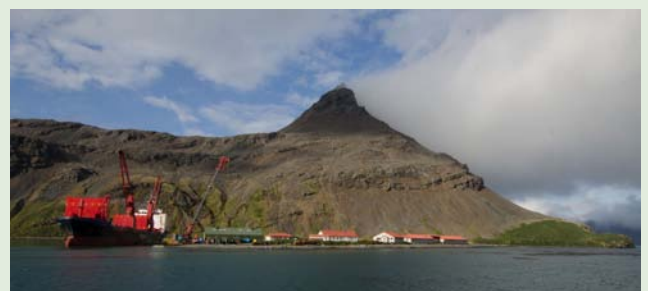
The cargo vessel Billesborg alongside the old wharf at KEP.

Work got underway on the new KEP wharf in January 2020, with work being undertaken by BAM-Nuttall (see Nov 2019 Newsletter), BAS's construction partner. The cargo vessel MV Billesborg arrived at KEP in mid-January to off-load most of the materials and the crane. By late-March the main jetty and slipway were nearing completion and work was underway on the dolphin. Construction work is due to be completed by the end of May. The new wharf will continue to facilitate the safe berthing of the Government's patrol vessel, Pharos SG , as well as now being capable of taking the new BAS research vessel RRS Sir David Attenborough .