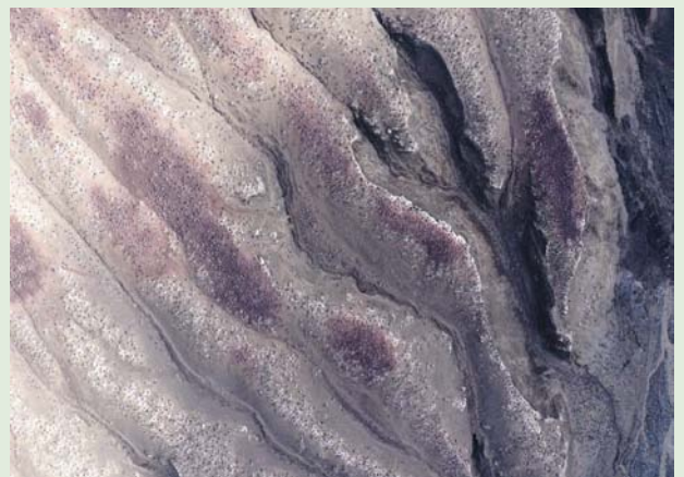
South Sandwich Islands Expedition (see page 8)