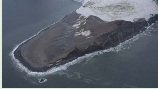
Beach Point, Thule Island, showing the pumice coloured rocks and algae around the Adélie penguin colony.

With hurricane force winds hitting the Falklands, we left Zavodovski before we pushed our luck. Heading for shelter on South Georgia would sound like a non-starter under normal circumstances, but we left the islands alone again, to exist in our imaginations until the next visit. Overall it was a massive success; we estimate that all of the teams got 80% of their wish list; an exceptional success for somewhere with so little shelter. It's great to have so much data to work on over the next few years; but being there is such a rare privilege. As I go through the imagery to extract data, I can't believe what we've just done.