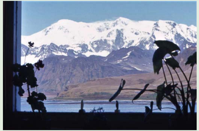
Fig. 3. Author’s view from his bedroom in Shackleton House, 1969.

Not all these botanical reminders of home were grown indoors. Attempts had been made to grow a few hardy flowers and herbs in makeshift raised beds beside the doors of some buildings. Signs of these “gardens”, together with some weeds, remained long after their creators had departed. In 1979, some daffodils and Falkland Islands plants were still growing in the Magistrate’s fenced compound on KEP a decade after being abandoned. Similarly, several unusual weeds were still growing by the door of the Manager’s villa and outside the main barracks in Grytviken. Some of these species had been recorded in situ in the early 1960s, and several individual plants persisted at least 50 years. One of these, cow parsley, existed for at least 40 years before it produced any offspring in the 1990s – no doubt a response to more favourable growing conditions.