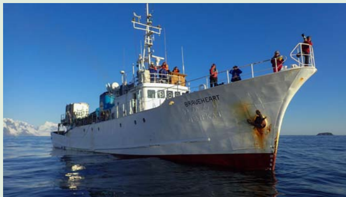
The Braveheart in calm waters between Undine Harbour and the Pickersgill Islands

Departing from Stanley on the 7 th January 2020, the team set off for a 33-day period at sea aiming to conduct visual transects, on route to, and around South Georgia, to gauge which whale species were using offshore and inshore areas. On passage to South Georgia, the seas were unkind and on-deck observations were impossible. However, some monitoring was still possible as the team had a nifty trick up their sleeve - a duo of acousticians and their handy team of sonobouys. Once placed in the water, sonobouys passively record underwater sounds and transmit this information back to the vessel via VHF radio. As large baleen whale species produce unique calls, it was possible to monitor which species were nearby on route to South Georgia – despite the bad weather.