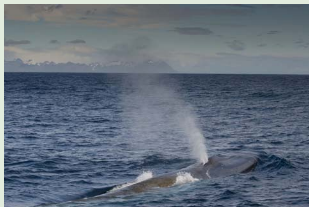
A blue whale blowing to the north-west of South Georgia

After the team arrived in South Georgia waters, whale sightings were an everyday occurrence - an hour rarely went by without a blow being spotted towards the horizon. However, the visual observation team had a challenge at hand. Not only did they have to spot the whales amongst the wind, spray and swell, but they needed to accurately identify the number and types of whales they were spotting. Each species is subtly distinguishable by their dorsal fin placement and shape, body size, skin patterning and colour. Although their blow characteristics are often a good tell-tale sign, interspecies impersonations were common.