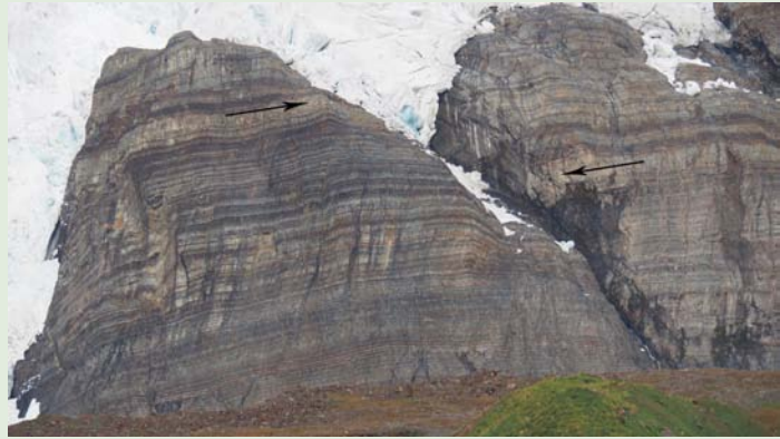
Fig. 3. This clean, recently deglaciated rock face on the north side of the Bertrab Glacier shows the marked variation in the thickness of the sandstone beds that make up most of the South Georgia rock succession. The fracture running from top left to bottom right is a fault plane that has dropped down the strata to the right (north), as best shown by the displacement of the thickest bed and identified by the arrows.