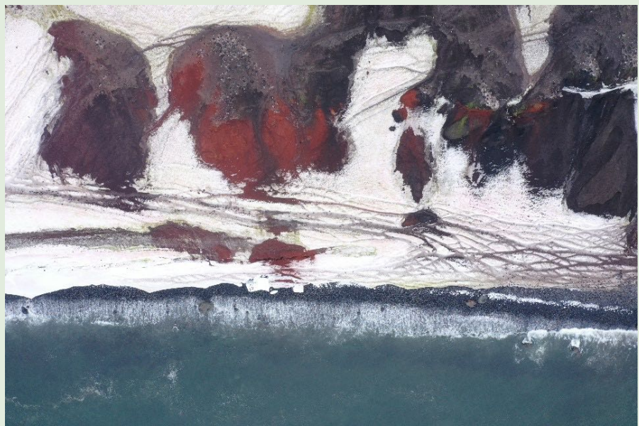
Aerial view of the busier highways on Thule Island between Wasp Point and Hewison Point.

Always following gaps in the weather, we headed south from Saunders Island to the Southern Thule group: Thule, Cook and Bellingshausen, before heading back up to Candlemas Island and finishing around Zavodovski. We landed everywhere we intended to apart from Zaovodovski, which we were able to survey using drones for both penguins and volcanology. Sailing under the steaming cliffs of Zavodovski between icebergs and while flying a drone is sensory overload!