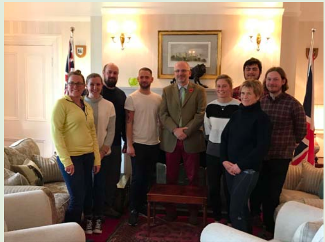
The new BAS King Edward Point wintering team with Commissioner Nigel Phillips in Government House.