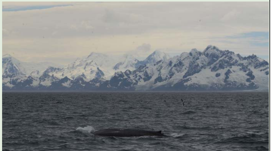
Humpback whale seen on the north coast of South Georgia.

This season would not have been possible without the contributions from the RV Braveheart crew and the team would like to say a massive thanks for their hard work, excellent vessel and co-operative team efforts