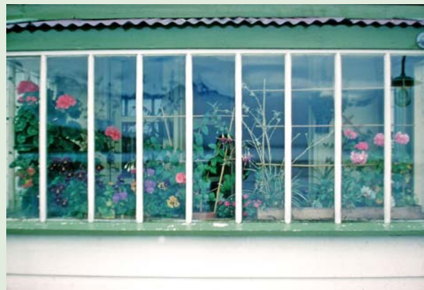
Fig. 2. Nigel and Jenny Bonner’s conservatory at KEP, 1950s, including geraniums, fuchsias, violas/pansies, spider plant, impatiens (aka busy lizzies). [With thanks to Jenny Bonner]