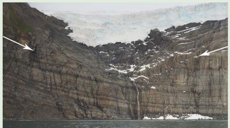
Fig. 2. Detail of the large fold structure exposed by retreat of the Bertrab Glacier. The arrows indicate the line of folding the axis of which runs approximately parallel to the cliff face and is symmetrical about a plane that is inclined towards the glacier. Erosion into the core of the fold has created its ‘mirror-image’ appearance on either side of the waterfall.