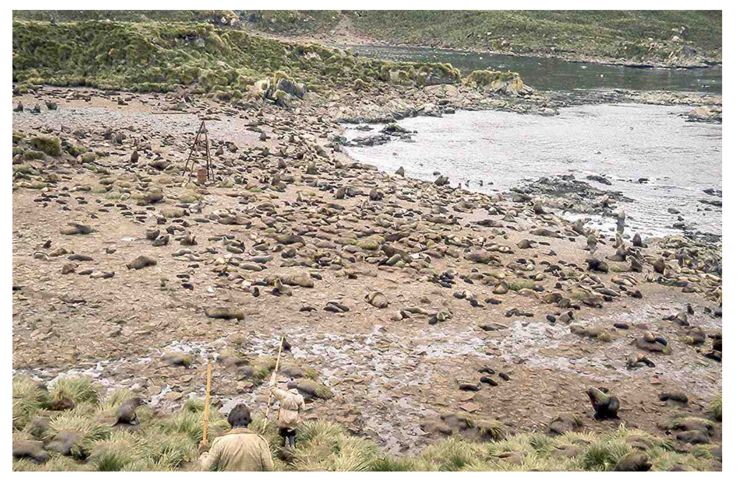
Entering a fur seal breeding beach. The bamboo poles are for fending off aggressive bulls.

main source of information has been the British Newspaper Archive. I had no need to actually visit the archive and spend days sitting in a reading room turning the musty pages of old newspapers because the pages have been scanned and are available online.