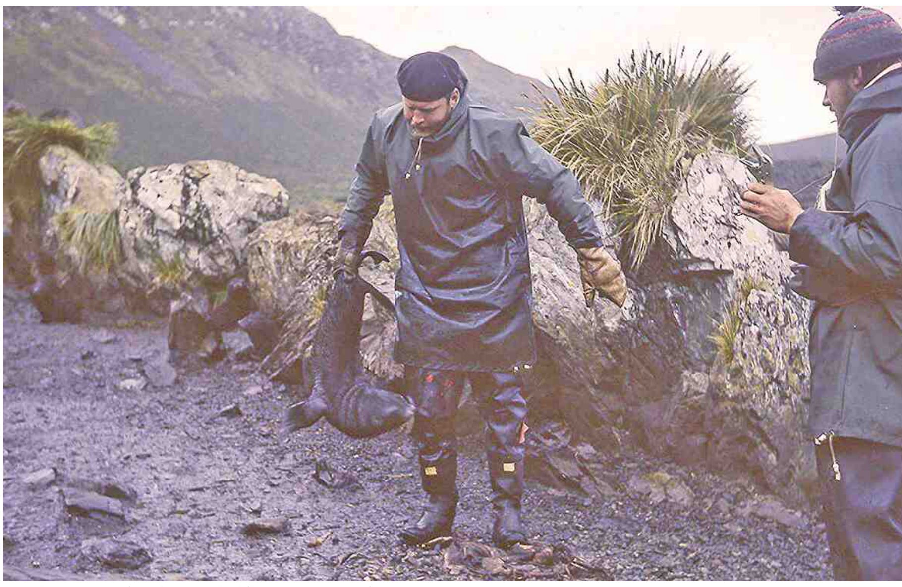
The author is carrying a fur seal pup by its hind flippers to a companion for tagging.

n January 14, 1972, the weather was awful. It was blowing a gale and the rain and sleet were coming at us sideways. My feet were painfully cold as I slipped and tripped over rocks and splashed through puddles. I was living on Bird Island, a small island off the main island of South Georgia, a U.K. Overseas Territory (rump of empire!) deep in the South Atlantic and on the edge of Antarctica. With two companions I was catching fur seal pups and marking them with numbered cattle ear tags clipped through their flippers.